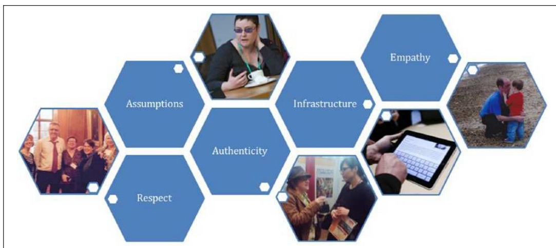
Figure 1. Current topics in participatory autism research.