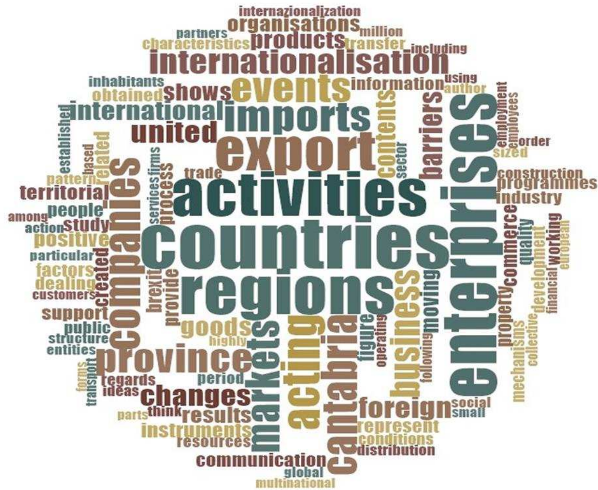
Figure 2 Word Cloud of Studies