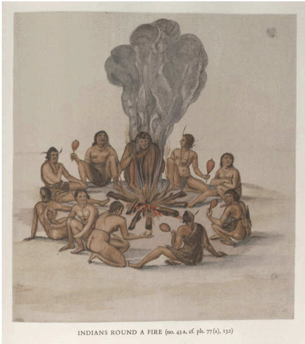
INDIANS ROUND A FIRE (no. 43A, cf. pls. 77(a), 132)