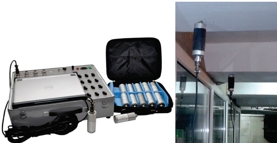
Fig. 2. Mobile vibro-measuring complex.

where P - the peak value of impact load, 2/a - time pulse.