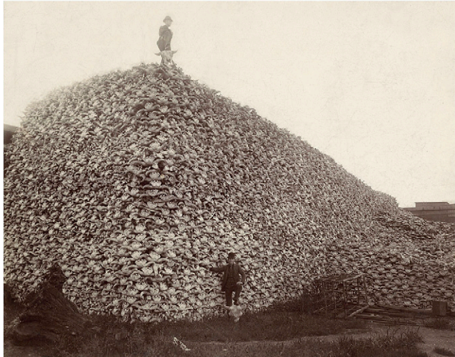
Fig. 1. Historic photographs illustrating scope of mammal extirpations. (Upper) Field of dead cattle during rinderpest outbreak in South Africa, 1896. (Lower) A massive pile of American bison ( Bison bison ) skulls ultimately ground for fertilizer, ~1870.

substantially more than the \sim 90\text{--}100 \text{ Tg CH}_4 \text{ y}^{-1} currently in IPCC inventories (12).