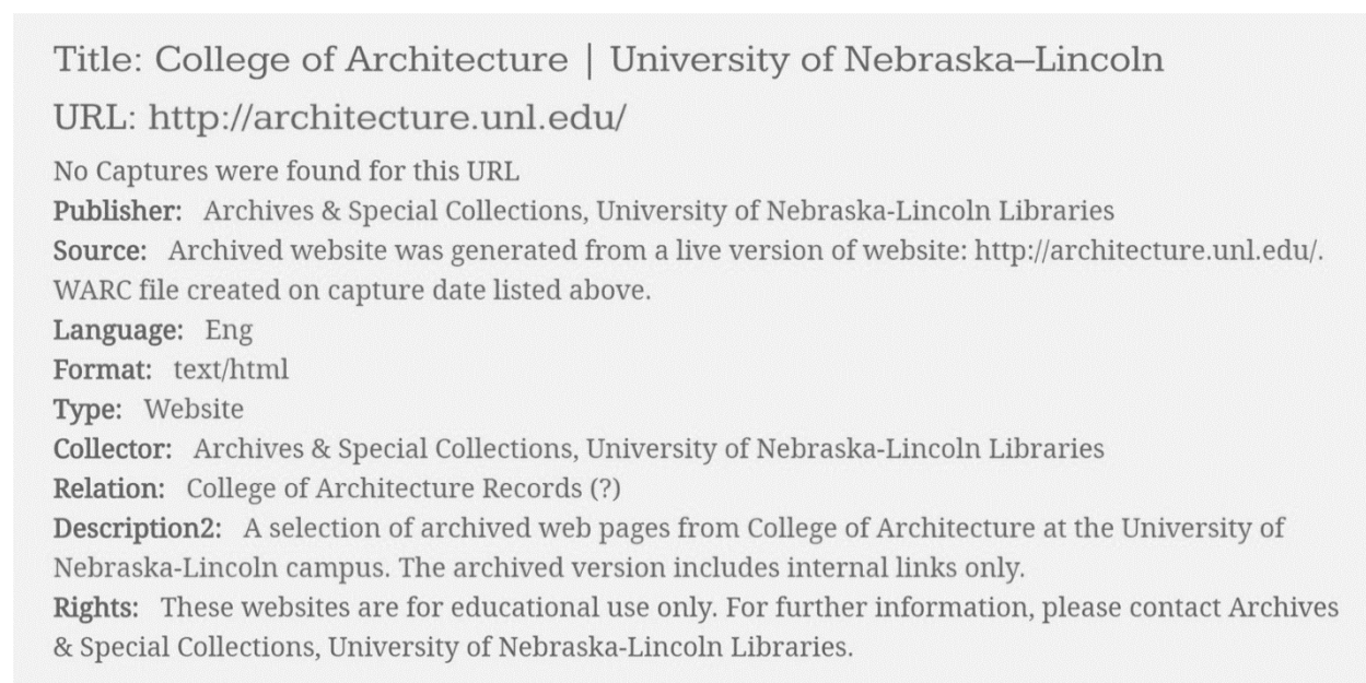
Figure 3. Screenshot View of Seed-Level Metadata in a Collection

hybrid set of elements based on DACS, RDA, and Dublin Core. In a timely coincidence, the WAMWG released a preliminary draft of their data dictionary while the UNL Archives team was developing metadata for seeds. Using both as guides, the team attempted to create Dublin Core-based metadata records for most of the seeds, and upload the "bulk seed metadata" csv file into Archive-It (see Figure 3). It's worth noting that both Subject and Dates fields were largely ignored during this process. Subjects were postponed until after the implementation phase, and Dates were automatically populated in Archive-It during crawl sessions.