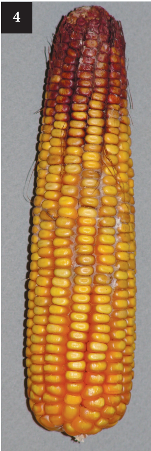
4. Gibberella Ear Rot