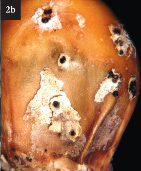
2. Diplodia Ear Rot