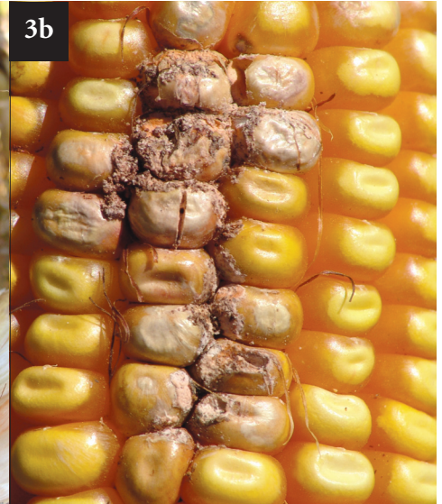
3. Fusarium Ear Rot