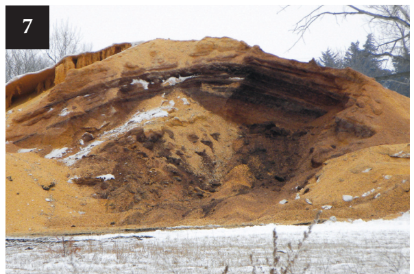
7. Moldy Outdoor Storage Pile