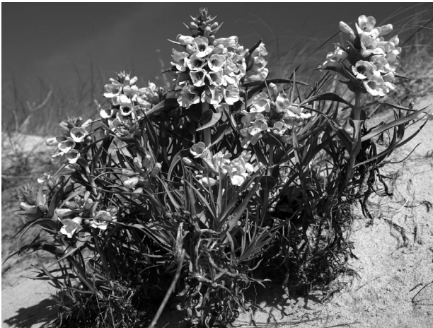
Fig. 1. Penstemon haydenii . Blowout penstemon

the dune removing the sand grains and blowing them up and over the rim of the blowout to an area of deposition. Blowouts move slowly across the landscape at a rate of 1 to 5 m yr -1 (Stubbendieck et al. 1989).