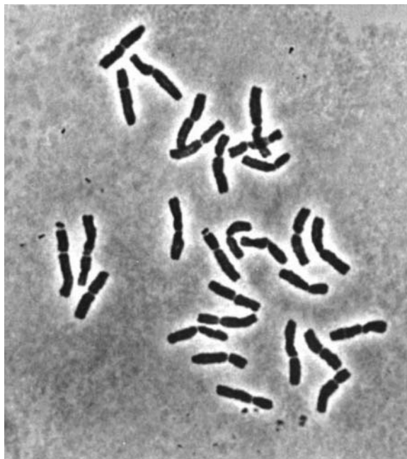
Figure 1. Mitotic chromosomes of B. ciliatus L. (before C-banding).