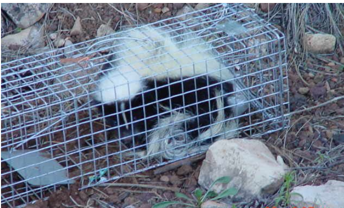
Figure 4. Striped skunks are one of the species most commonly involved in wildlife nuisance complaints.

For example, Georgia law prohibits the transport of wildlife from one location in the State to another unless the animal is in possession of the trapper and the trapper has the appropriate licenses or permits. Although this prohibits most Georgia citizens from trapping, transporting, and releasing wild animals, translocation is still legal under some circumstances. To avoid spreading disease, Georgia wildlife officials also suggest euthanizing species that commonly serve as rabies vectors (i.e., raccoons, skunks, foxes, coyotes, and bats) rather than translocating them.