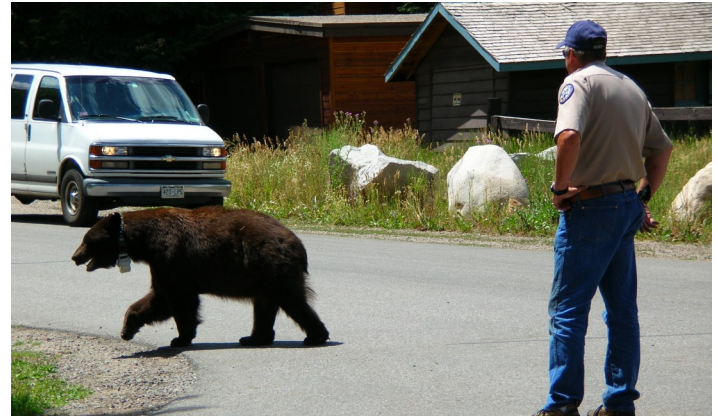
Figure 5. Black bears often are translocated when they become a nuisance in campgrounds or near houses, or cause considerable damage to farms and crops.

environment, these small rodents begin by making a straight-line excursion in a random direction. They travel about the same distance they might travel when foraging within their home range. Upon realizing that they are not in their normal home range, most individuals make an abrupt U-turn and return to the release point, then move in another random direction.