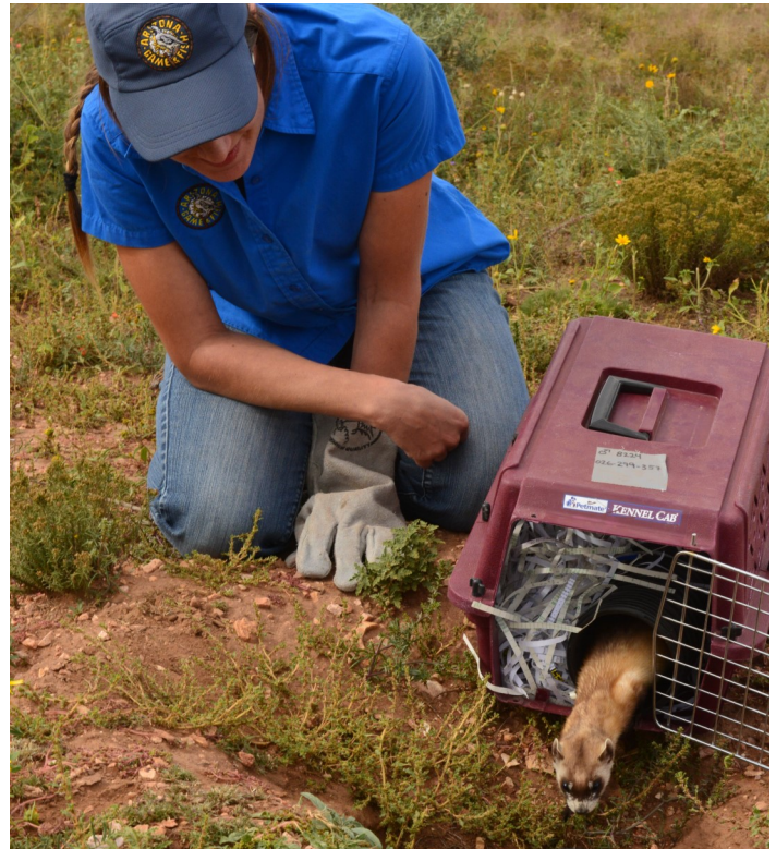
Figure 2. The endangered black-footed ferret is one species whose recovery has been helped by captive breeding and translocation.

Captive breeding and the release of captive bred animals is an important conservation tool for restoring threatened and endangered wildlife populations. Additionally, free-roaming wildlife are sometimes captured and translocated