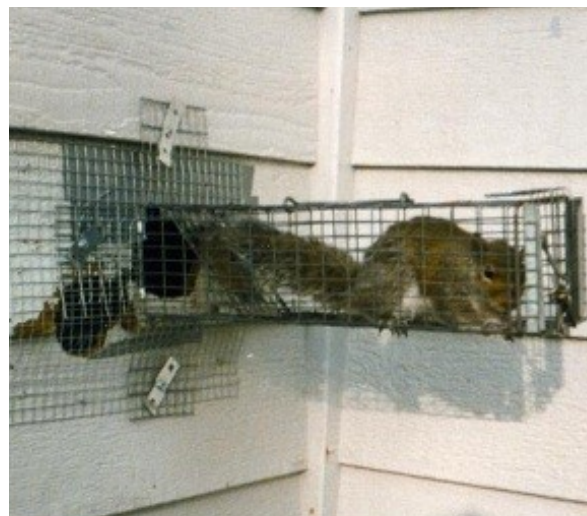
Figure 1. Squirrels can damage homes and other structures. This squirrel has been captured in a live trap near the damaged site.