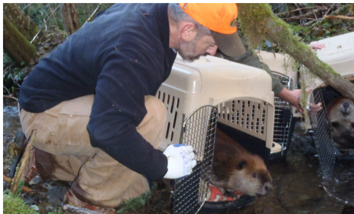
Figure 3. Beavers being translocated to a new habitat in Oregon in an effort to restore populations.

Numerous public opinion surveys report that people believe translocation is an effective and humane method for addressing nuisance wildlife conflicts. However, research repeatedly shows that it is not. Similarly, it does not effectively control wildlife populations and rarely benefits the animal.