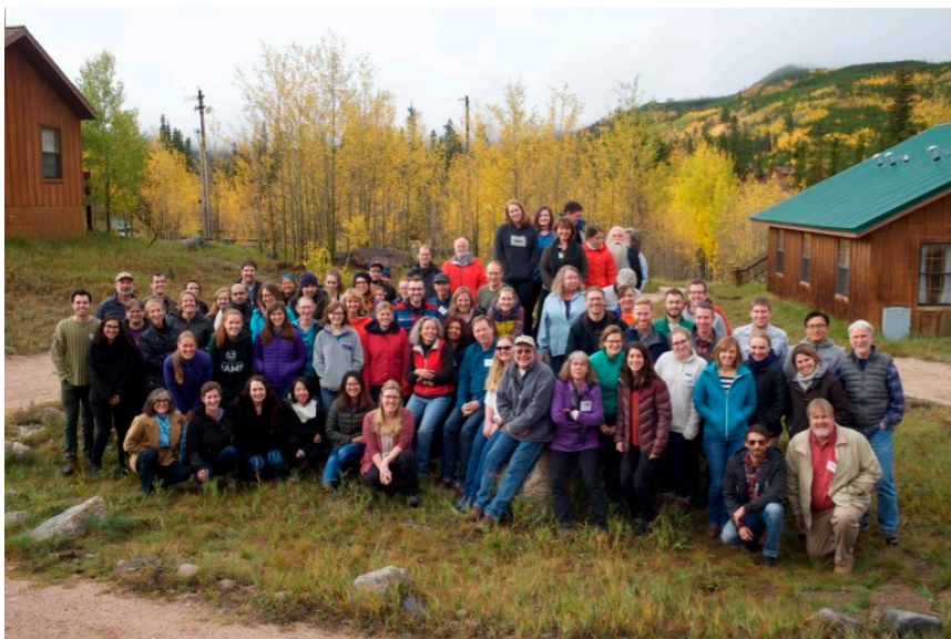
Figure 2. Attendees at the 2017 meeting of the Rocky Mountain Virology Association in the Mountain Campus of Colorado State University.