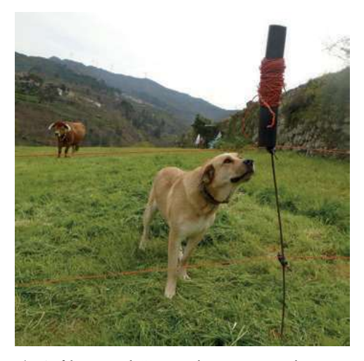
Fig. 6. If done properly LGDs can learn not to cross electric fences, like this Estrela Mountain Dog in Portugal. This can be used to control their movements and prevent them from leaving pastures.

Spaying or neutering working LGDs can reduce wandering (e.g. Green and Woodruff, 1988, 1990; Lorenz and Coppinger, 1986), and it can facilitate multiple LGDs working together in a group without conflict (van Bommel, 2010). Neutered LGDs were found to be equally effective as sexually intact LGDs