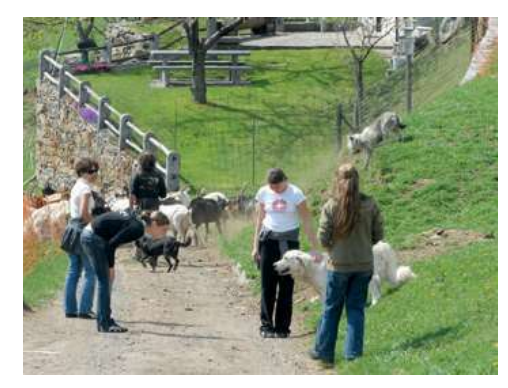
Fig. 5. Visits to farms promote socialization between LGDs and tourists decreasing dog aggressiveness towards strangers, and raise people awareness about their important role and on how they

Educating farmers to improve LGD control is also important. Promoting networking and experience ex-