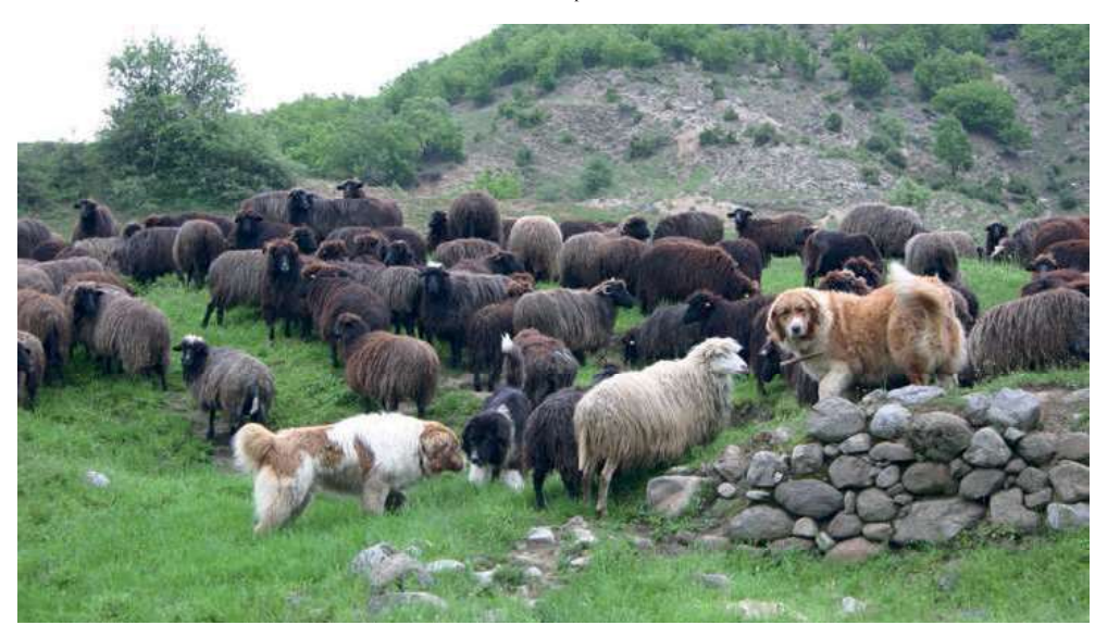
Fig. 7. LGDs work best in a group, but it is important to have a balanced dog team to optimize each dog abilities and joint performance, like in this group of Karakachan Dogs in Bulgaria.