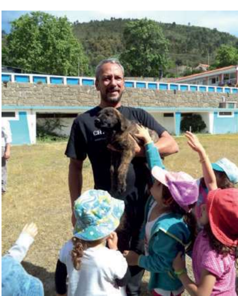
Fig. 3. LGDs visit schools to teach children about their important work and how they should relate with these dogs. Such actions are frequently developed in Portugal, either by Grupo Lobo, in collaboration with local farmers and dog breeders, but also by dog breeders.

In Portugal, Grupo Lobo and dog breed clubs organize talks and visits of LGDs to schools to interact with children and to teach them about how they work (Fig. 3), and in Bulgaria, Semperviva and