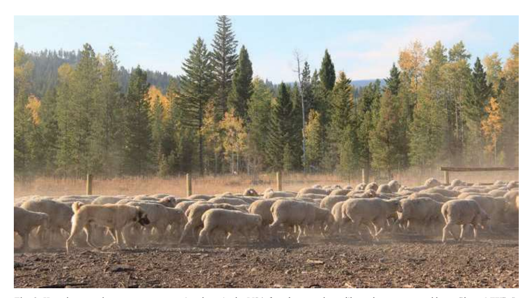
Fig. 8. Kangals are used to protect open-ranging sheep in the USA from large predators like wolves, coyotes and bears.

in protecting livestock from coyotes (Canis latrans) in the USA (Green and Woodruff, 1988, 1990; Lorenz and Coppinger, 1986) and carnivores in Africa, including cheetahs (Acinonyx jubatus) and leopards (Panthera pardus) (Marker et al., 2005a,b). Concerns have been raised that neutered LGDs might not be as effective as sexually intact ones when protecting livestock from wolves (Canis lupus), but we are not aware of any scientific data supporting this assertion and it should therefore be further investigated. Neutering makes LGDs less distracted by breeding urges or caring for pups, and therefore more attentive to livestock, but also prevents the farmer from breeding them and producing replacement pups. However a select pair can be kept intact for breeding purposes, under closer supervision by the farmer. In some countries, like Australia and the USA, farmers are actively encouraged to neuter/spay their guardian dogs to prevent behavioural problems, and, in Australia, to prevent the risk of breeding with dingoes (Canis dingo). In other countries neutering/spaying is not common. For instance, in Bulgaria traditionally only problem dogs are neutered/spayed. Intact dogs should always be kept under close supervision of the farmer to avoid unwanted breeding.