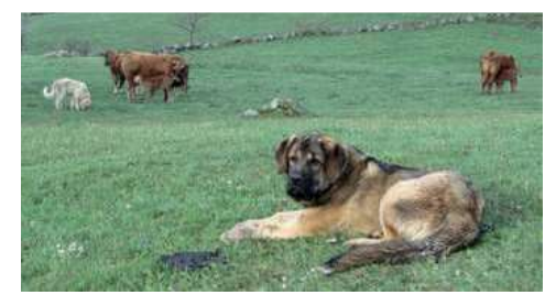
Fig. 13. LGDs can establish strong bonds with cattle, but extensive management systems may require some initial adaptations to promote the bonding between them. Dogs can be confined with replacement heifers or during the stabling season, as these Great Pyrenees, in Switzerland and France (above), afterwhich they can accompany the herd to the pastures, like these Spanish Mastiffs, in Spain (below; photo: Juan Carlos Blanco). The use of LGDs in less suited husbandry systems can be overcome with proper technical support and networking between farmers.

Livestock protecting their young can be a threat to young LGDs, so pups should not be raised with particularly aggressive mothers. Especially in the case of sheep/goat flocks, extra care should be taken if placing pups during the lambing season to prevent damages that may occur due to playful behaviour from the dogs. When first releasing young dogs into pastures it is important to make sure they are old enough (both physically and mentally) to accompany livestock and defend themselves or escape from predators. Temporary shelters for pups should be provided near areas frequently used by livestock (hay dispensers, water, nigh-time bedding sites). Livestock can be encouraged to approach dog shelters using treats (e.g. salt blocks).