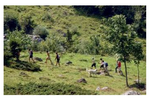
Fig. 16. LGDs chasing or biting hikers can result in legal liabilities for farmers, and adequate supervision of the dogs is essential if pastures are close to hiking trails, complemented with proper information of the public and, if available, with a specific insurance.

The discussion surrounding the issues addressed above highlights the need to gather more information about the efficiency of LGDs and their use in different ecological, social and cultural contexts. Empirical