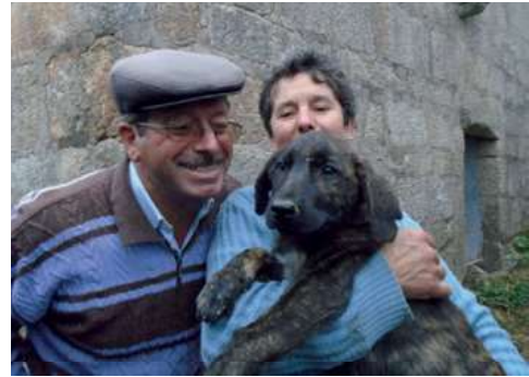
Fig. 1. Affinity and motivation to use LGDs can be limited in regions where their use was not part of the traditional husbandry, contrary to what happens in Croatia, where shepherds still value the work and company of their Tornjak Dogs (Bosnian and Herzegovinian – Croatian Shepherd Dog) (top), or in Portugal, where in some regions farmers are happy to get an Estrela Mountain Dog pup (bottom).

to work to change this attitude by sharing information and raising the awareness of the community, and of farmers in particular, about the benefits of using LGDs. Economic, ethical, and welfare issues concerning wildlife and livestock can be used to convince farmers to use long-term non-lethal tools to mitigate conflicts.