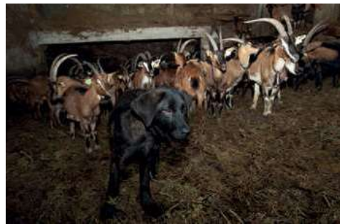
Fig. 11. LGDs are only fully effective after reaching adulthood, and thus a proactive strategy should be in place to attain optimal protection when predation risk increases, and pups, like these Estrela Mountain Dog (top) or Castro Laboreiro Dog (down) from Portugal, should be bonded in advance with the livestock. When using pups is not viable due to the urgent need of protection, older dogs, already bonded to the livestock may be obtained.

received as puppies. In the latter case, owners spend more time with the LGDs and experience their puppyhood and juvenile periods, which could result in a stronger bond between them.