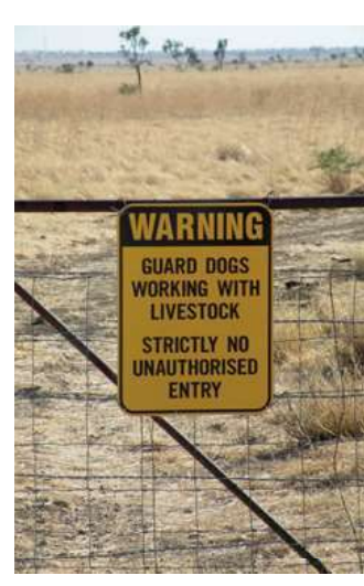
Fig. 4. Examples of signs used in different countries to warn about the presence of LGDs in the pastures with livestock, and inform on how to behave in their presence to avoid interfering with their work and prevent potential conflicts (left to right: Switzerland, Italy and Australia).

the Balkani Wildlife Society, developed an exhibit and an activities' book for children focusing on large carnivores and the role of LGDs (Fig. 2). Similar initiatives and programmes could be made mandatory in other regions where LGDs are used. Such campaigns could be complemented with warning signs about the presence of LGDs in pastures, and also schematic information on how to behave and handle other dogs where LGDs are present. For example, in the USA, France, and Switzerland, signs are available for farmers using LGDs on either public or private lands to post warnings and provide information. Such signs have been produced and made available to farmers in other European countries under specific projects, and can easily be provided by Farmer Associations (Fig. 4).