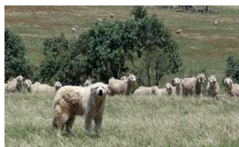
Fig. 9. The Maremma Sheepdog is used in farms across Australia to protect sheep, goats or cattle from wild dogs, but also less typical livestock, like domestic fowl.

in areas anticipating the return of large carnivores, considering the implementation of LGDs may take some time to reach optimal levels of dissemination and efficiency. Such measures have been implemented in several countries, for example Bulgaria, where in the scope of the agro–environmental measures, farmers using autochthonous LGD breeds to protect livestock grazed in high mountain pastures inside National Parks receive higher subsidy values per hectare.