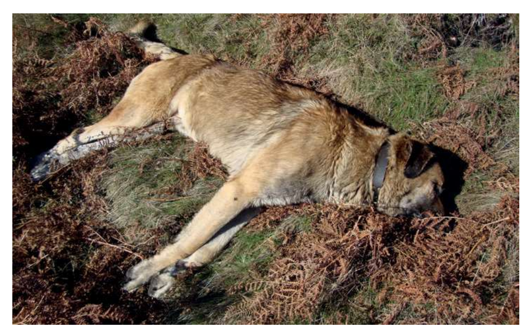
Fig. 15. The use of illegal methods to lethally control predators can have a big impact on the population of LGDs. Poisoning can be responsible for over 30% of the deaths in some countries, like Portugal, where this Estrela Mountain Dog died after eating a bait poisoned with strychnine.

Prevention is key, and with proper and regular veterinary care most problems are easily solved. Owners should have access to experienced veterinarians, specialized in dog care, to regularly monitor and