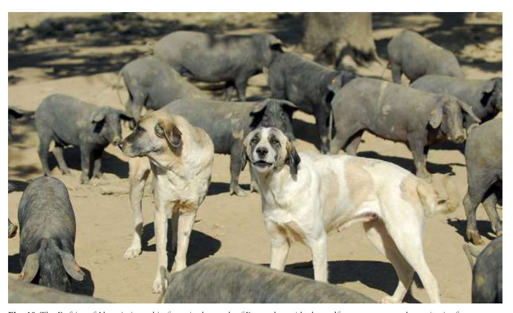
Fig. 10. The Rafeiro of Alentejo is used in farms in the south of Portugal, outside the wolf range, to protect domestic pigs from mesopredatotors, and keep wild boar ( Sus sarofa ) away from the pastures. These dogs reduce the transmission of diseases to the domestic pigs, prevent wild boar from breeding with and injuring them, and exclude the wild species from the pastures avoiding competition with the domestic one.

Some farmers may consider the time invested to raise and maintain LGDs a constraint. Every method requires some time investment and maintenance, and when considering the time involved in other farm activities, taking care of LGDs (e.g. feeding) is not very time-consuming. Nevertheless, in some cases adding extra effort to an already hard working routine can be tough (e.g. typically when shepherds need to bring food to LGDs on a daily basis, especially when