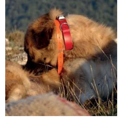
Fig. 12. The use of GPS collars can help with specific training needs or control inappropriate behaviours, make monitoring LGD activities easier, like with this Maremma Sheepdog in Australia (top), and even increase the farmers' interest and care for their LGDs, as observed in Italy (left). GPS and bright collars, like the one used by this LGD in France (right), can also help locate dogs that are missing, identify them as working dogs and reduce the risk of being shot by hunters.