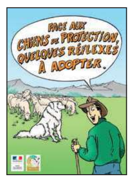
Fig. 2. Educational materials produced in France and Bulgaria to inform children and adults on the function and behaviour of LGDs and how to behave in their presence.