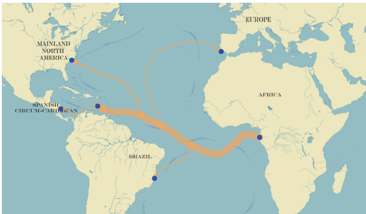
Figure 3. Routes for British slave ships 1735-1833.