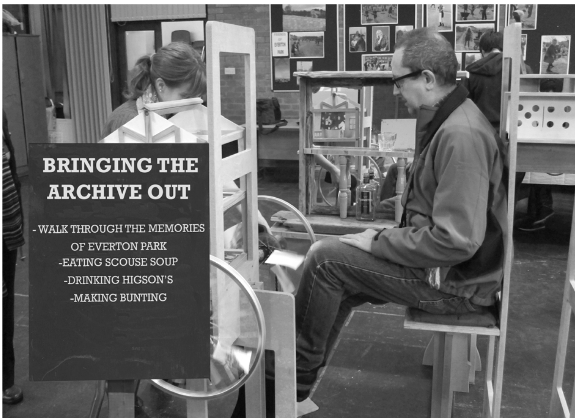
Fig. 1. Bringing the Archive out, Liverpool 2010

The methodology of engagement happens through intriguing built objects and structures called "conversation kits" which initiate dialogues. This method establishes a non-hierarchical relationship where trust can start to form without the requirement of a direct and efficient outcome. The dialogues establish a series of relationships, which act as the future support network of the social and political architectural/urban project.