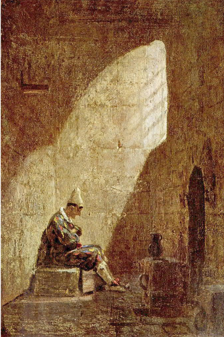
Figure 1. Carl Spitzweg, "Ash Wednesday," 1855.