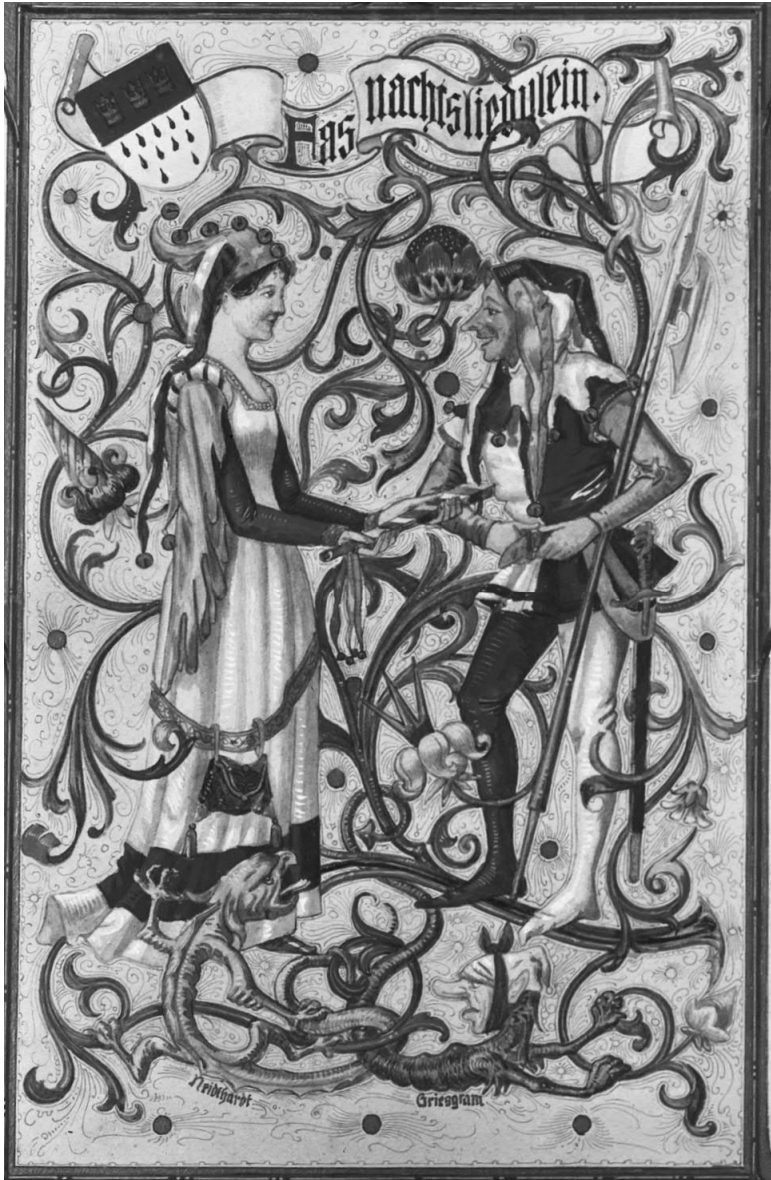
Figure 3. Carnival Jester and Maiden stand triumphantly over the enemies of Carnival, “Griesgram” and “Neidhard.” Early Nineteenth Century.