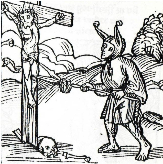
Figure 2. Woodcut from Sebastian Brandt's Das Narrenschiff (1494). Source: Sebastian Brant, Das Narrenschiff , (Nuremberg: Peter Wagner, 1494), (Enlarged copy of the Exemplar of the Berliner Staatsbibliothek Preußischer Kulturbesitz), 134.