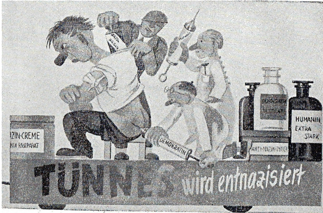
Figure 6. Rosenmontag Carnival Float, "Tünnes wird entnazisiert." 1950.