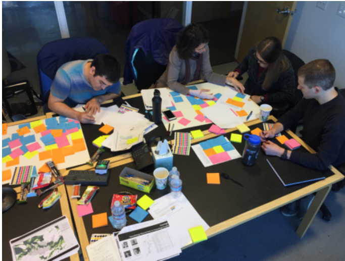
Figure 2. Participants collaboratively brainstorm ideas in a creative-visualization opportunities workshop.

Specifically, our meta-analysis used the approach of critically reflective practice , which “synthesizes experience, reflection, self-awareness and critical thinking to modify or change approaches to practice” [10]. This approach provided us with a methodology to combine analysis of workshop documentation and existing theory with our collective experience. Conducted over two years, our reflective analysis iterated between: focused periods of analysis and writing; incubation and reflection on what we had written; followed by more analysis and rewriting. We generated a broad range of artifacts during the analysis to support our reflection, including an evolving model for describing CVO workshops, written reflections on workshop successes, and collaborative writing about the overall value of workshops to applied visualization research.