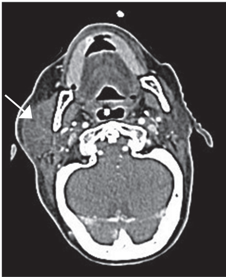
Figure 2: Axial image from a contrast-enhanced neck CT scan. Inflammation involving both the superficial and deep lobes of the right parotid gland (arrowed).

based on haematology advice. She suffered no abdominal or cardiorespiratory post-operative complications and was discharged home the week after finishing her course of antibiotics.