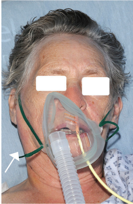
Figure 1: Medical photograph of right parotid gland swelling. Asymmetry of the neck with enlargement of the right parotid gland (arrowed).