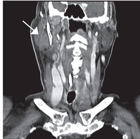
Figure 3: Coronal image from a contrast-enhanced neck CT scan. Thrombosis of the right internal jugular vein (black arrow) and inflammation of the right parotid gland (white arrow).

Central venous catheterization is the most common cause of IJV thrombosis, and central venous catheter infections usually