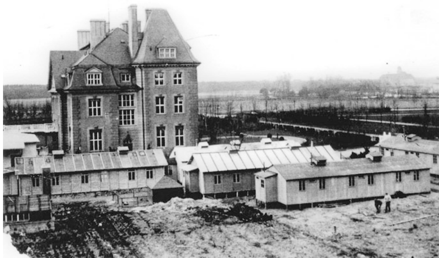
Fig. 7 Haber's KWI for Physical Chemistry and Electrochemistry with surrounding barracks, circa 1917.