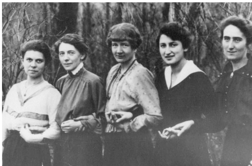
Fig. 5 Out of the 1,500 employees of Haber's KWI after it became the German center of chemical warfare research and coordination, the majority were women.