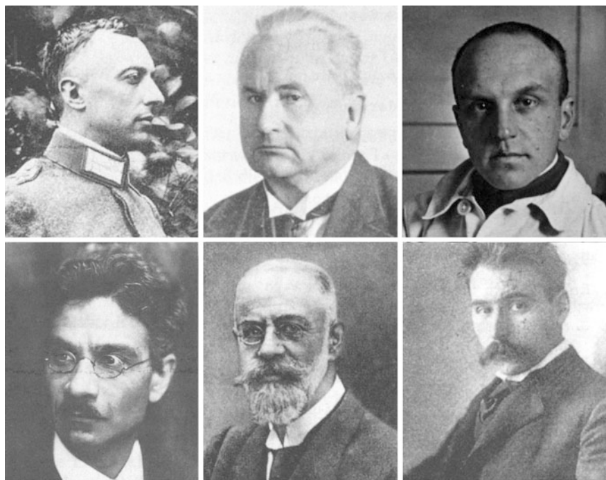
Fig. 6 Prominent heads of chemical warfare departments at Haber's KWI for Physical Chemistry and Electrochemistry when the institute was under military command. Clockwise from top left : Friedrich Kerschbaum, Ferdinand Flury, Heinrich Wieland, Reginald Oliver Herzog, Paul Friedländer, and Herbert Freundlich.