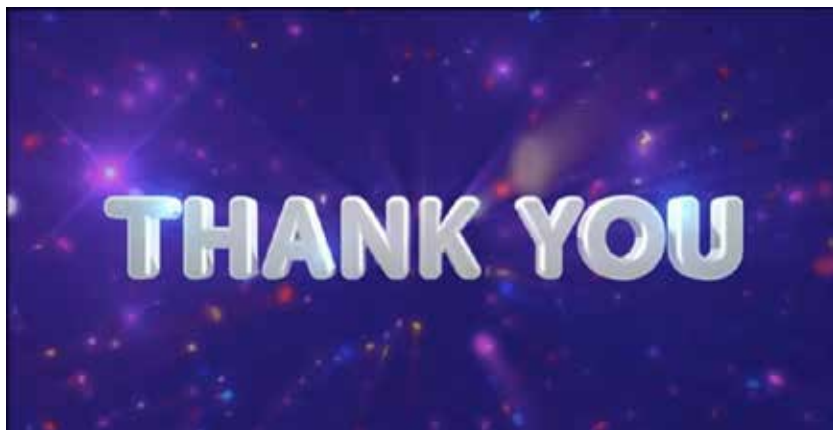
2.6. Children in Need , 13 November 2015, BBC1.