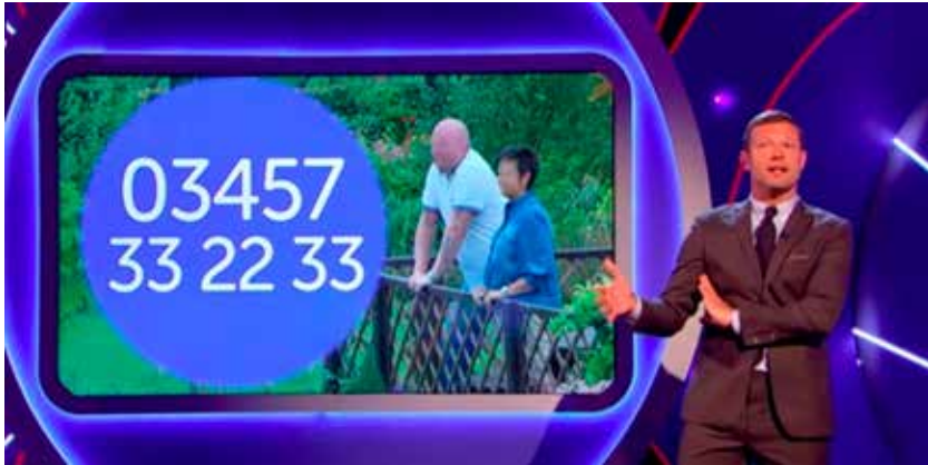
2.2. Dermot O'Leary, Children in Need , 13 November 2015, BBC1.

young riders involved in the challenge are identified, all of whom have, she observes, previously been supported by projects 'funded by Children in Need'.