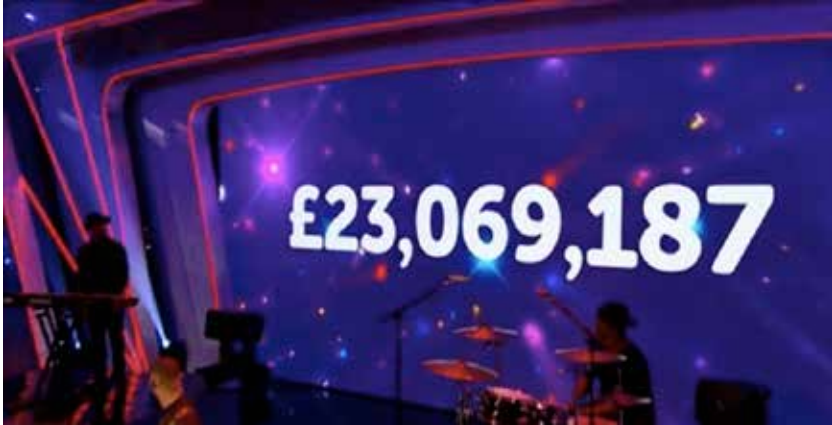
2.3. The 'Totalizer', Children in Need , 13 November 2015, BBC1.