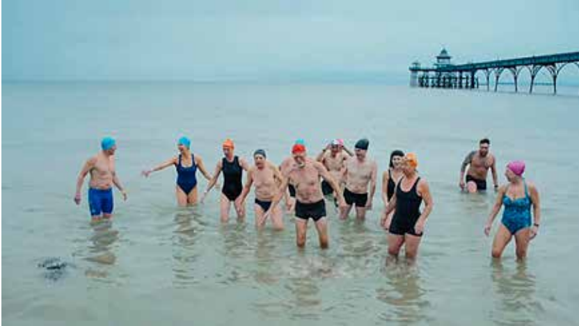
2.14. 'Wild Swimmers', One-ness ident , dir. Martin Parr, 2017, BBC1.

made to the policy at that time of branding of the BBC as 'One BBC'. In 2017, this concept was reimagined as 'One-ness'. Current idents for the channel exemplify the participatory aspects of this concept as they picture a variety of different community groups undertaking various activities, including aerobics, wild swimming, and urban skating (Figure 2.14).