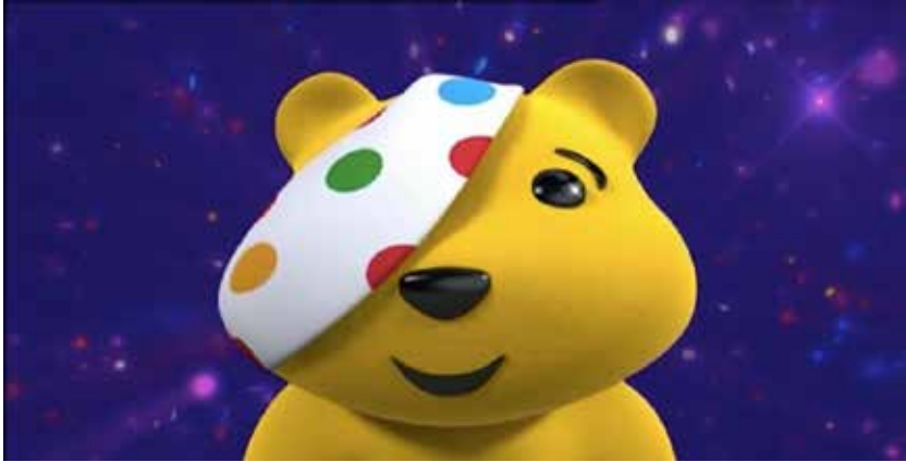
2.4. Pudsey, Children in Need , 13 November 2015, BBC1.

Yet, in practice, the relationship between the network and regions and nations has often been more problematic. In the BBC Archives, a considerable number of papers demonstrate the way in which other parts of the BBC felt that they were excluded or marginalized by the demands of the producers in London.