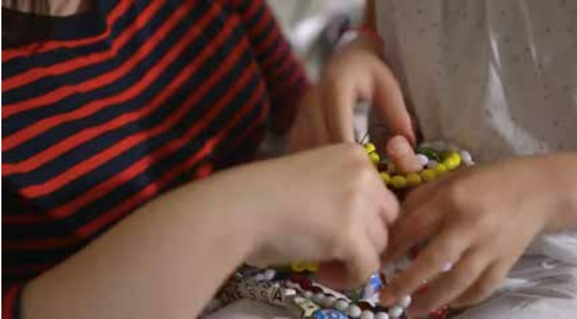
2.12. 'Vanessa's Story', from Children in Need , 17 November 2017, BBC1.

feminized reminders of what were painful and ultimately unsuccessful medical procedures; at the same time and, in the context of my argument, they might also recall beads on an abacus, representing the calculations, numbers, and currency underpinning Vanessa's life story (Figure 2.12).