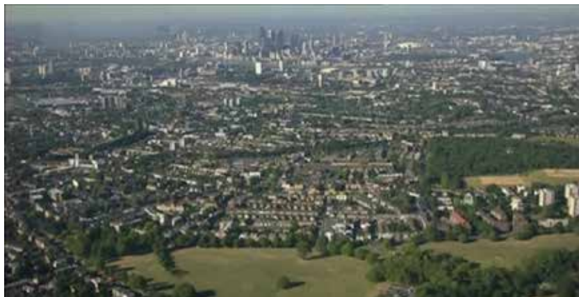
2.5. 'From Morecambe to Milton Keynes', image from interstitial sequence, Children in Need , 13 November 2015, BBC1.

context in which television programming and audiences are increasingly spread across numerous digital platforms and independent providers. The continuing success of the programme sustains an illusory national audience, and thereby shores up the currency that underpins the financial basis for the BBC.