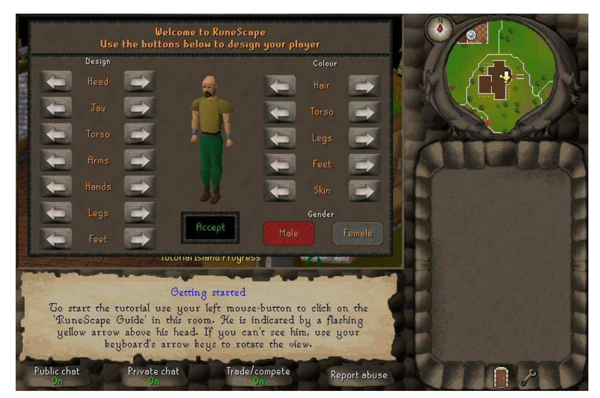
Figure 5: The design page to construct a character

In her ethnographic account she says her character first had to be 'born' and she had to learn the basic skills before continuing into the full MMORPG world. In 'Tutorial Island' she learnt how to read the map, understand the symbols and acquire basic skills such as running, combat, mining, smelting, fishing, fire lighting and much. She felt that although this improved her knowledge of the technological skills needed within RuneScape, it did not reveal much about the culture of RuneScape.