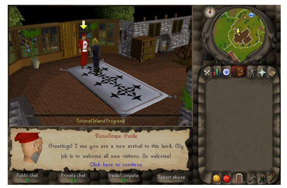
Figure 6: The castle courtyard in Lumbridge

She wrote that 'after completing 'Tutorial Island', Xiaphon was transported to a busy castle courtyard in Lumbridge... and so Xiaphon's life began in RuneScape.'