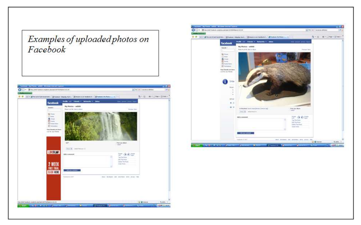
Figure 4: Examples of uploaded photos on Facebook

His Internet usage is comprised of two domains, which are work and leisure pursuits. He uses the University website for his studies and Teamtalk Football News for leisure. He noted that corporations dominate the websites, whether they are educational institutions or News organizations. He was, however, surprised to discover that the website he spent 22% of his time on, making it his second most popular web page, was Facebook. He argues that he could not easily bracket this social networking web service into either work or leisure because he felt that it covered most of his life. He therefore undertook an auto-ethnography to better understand his participation within it and how that reflected his interactions in his social life.