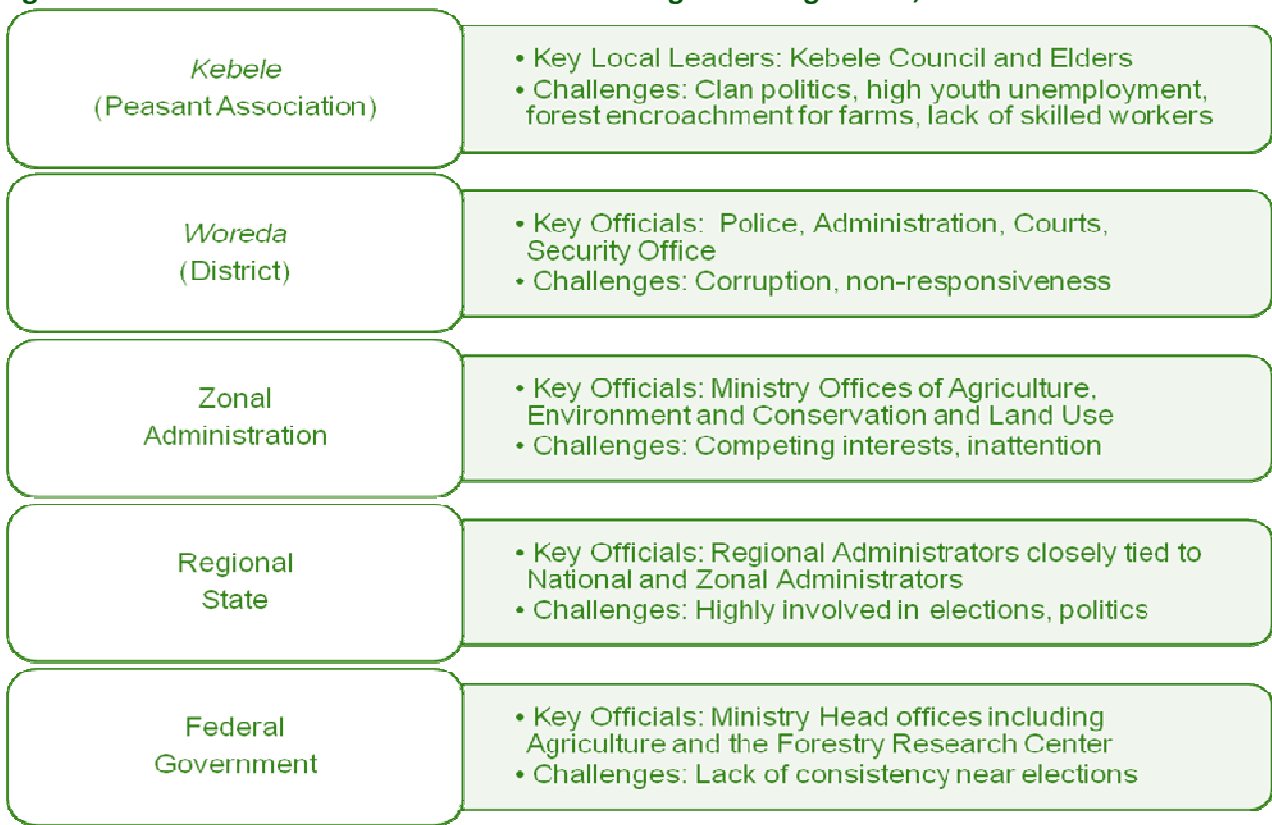
Figure 3: Government entities involved in enforcing forest regulation, Arsi Forest