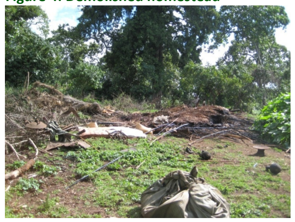
Figure 4: Demolished homestead

Household possessions are bundled in the foreground and roofing, fencing and other building materials are piled in the mid-ground. A native Podocarpus tree is shown in the centre background.