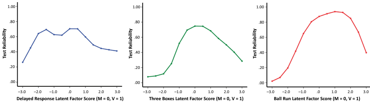
Figure 2. Measurement precision (reliability) as a function of ability for the Executive Function task latent factors at 14 months. Note. Approximate reliability coefficients ( \rho ) were computed from the total information curve for each task latent factor using the following formula: \rho = 1 - \frac{1}{\text{Inf}} .

Run was most reliable ( \rho > .80 ) in the high range of ability ( 1 < \theta < 2 ).