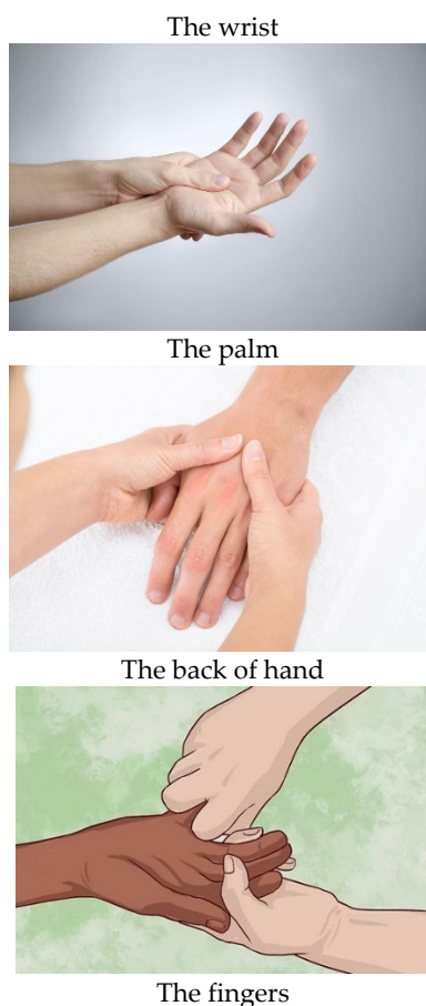
Figure 3. The points of hand reflexology.