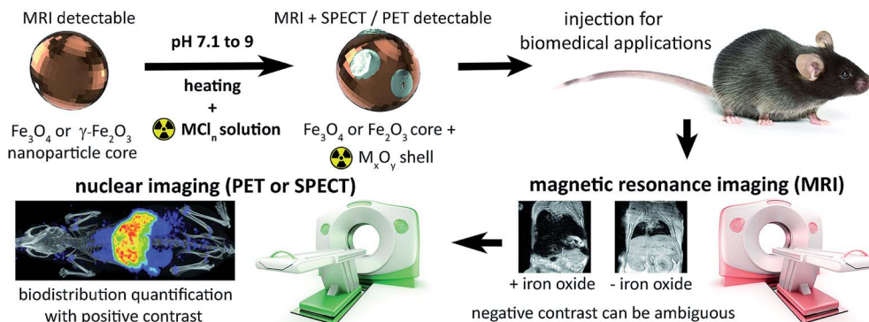
Fig. 1 Synthesis of radiolabelled IONPs using radiometal chloride salts ( MCl_n ) to form an oxidised radiometal coating allows whole-body non-invasive quantitative imaging using PET or SPECT, in addition to high-resolution detection using MRI.

coated IONP ferumoxytol (Feraheme®) with a range of more commonly available radiometal isotopes, including ^{89}\text{Zr} and ^{64}\text{Cu} for PET and ^{111}\text{In} for SPECT. 17 Particles were heated in an aqueous solution with the radiometal chloride ( \geq 80^\circ\text{C} was optimal for most metals tested, including Zr, Cu, and In) at a pH between 7–9. However, despite ongoing interest in this method, 2,7 the nature of the chemical interaction between the metal isotopes and iron oxide nanoparticles remained unidentified. 18