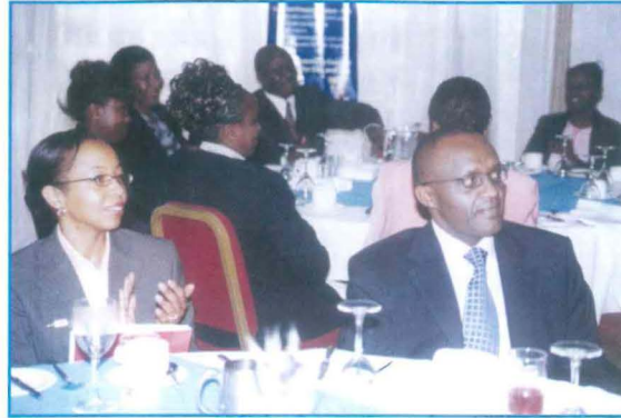
Guests listen to a presentation during the breakfast meeting

The 2004 Careers Fair held on 5 th November was well attended by students who gave very positive feedback on the task of searching for a job. The