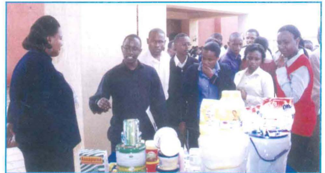
Students jam the Unilever Stand during the Careers Fair day

The Placement Office put up a stand representing Strathmore University at the NSE's 50 th Anniversary Celebration Exhibition from 24 th to 26 th November 2004 held at the Kenyatta International Conference Centre. The main aim was to market our students and Strathmore as a high quality learning institution to the financial institutions exhibiting at the Conference.