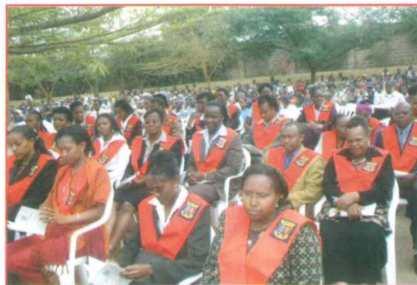
A section of the graduates await their convocation

There were 502 graduands in total drawn from the School of Accountancy (SOA)