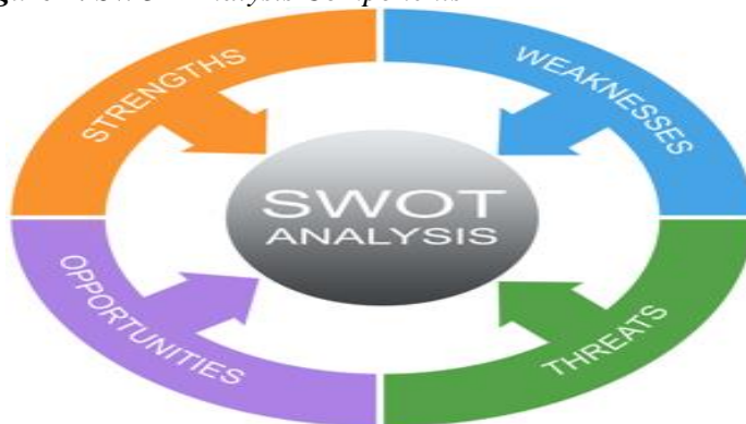
Figure 1. SWOT Analysis Components

Analysing the main components of the problem needs defining the strengths, weaknesses, opportunities and threats of the problem which leads to a SWOT analysis (Figure 1).