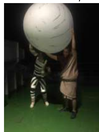
Fig. 2. Radiosonde launch on the evening of March 4 to measure the atmospheric boundary layer.

The weather forecast was good and we were optimistic that we could do the 700 nautical miles in about four days and reach our first station in Spanish waters during the night from Saturday to Sunday. But not only we but also the weather forecast was too optimistic. The reality in the last five days consisted of winds 7 to 8 against which the Poseidon steamed untiringly and of 5 to sometimes even 6 meters of sea. So today we continued the fifth day rocking and rolling with the waves, whipping