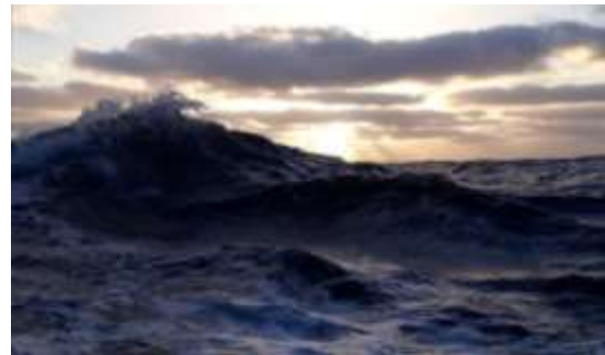
Fig. 5: Swell between Cape Verde and the Canaries (Dennis Booge).

In the water samples we examine exactly, as in the surface samples on the transit, various biogenic and anthropogenic trace gases, the marine carbonate