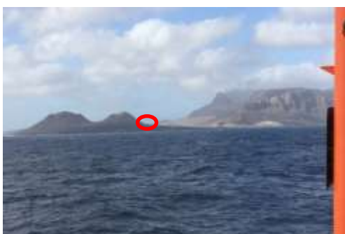
Fig. 3: Sao Vicente with the Atmosphere Observatorv CVAO.

then we started the transit to the Canary Islands. On the way, 3-hourly water and air samples were taken from the surface as usual, which were immediately investigated in the laboratory for trace gases, nutrients and phytoplankton (Fig.4).