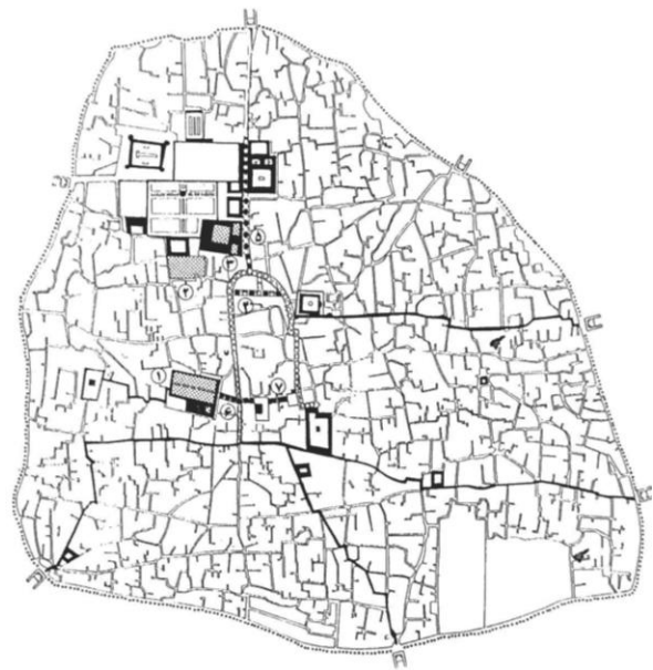
Physical structure of Shiraz city and formation of its paths