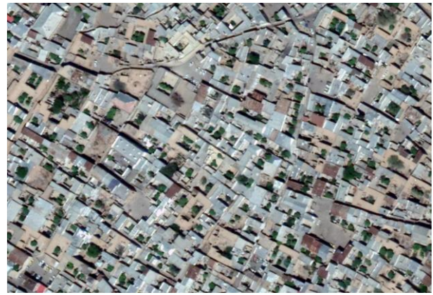
Changes in Urban Morphology of Shiraz-2017