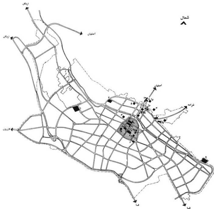
Shiraz Historical texture of Shiraz and its position in contemporary city