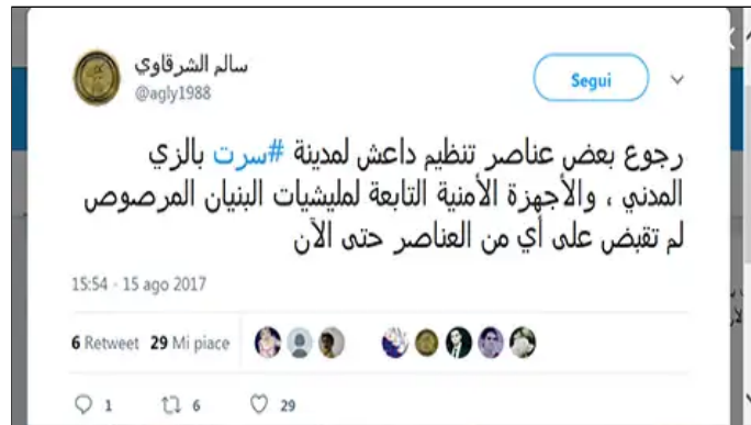
"Return of some elements of Daesh with civilian dresses to Sirt and the Department for Security of the militias Al-Bunīān Al-Marsūs has not arrested anyone in these elements until now." (Twitter)