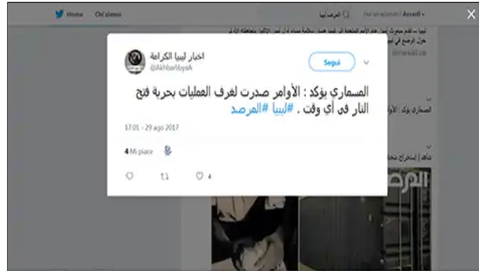
"Al-Mismari states: orders have been issued to the Operation Room regarding the freedom to open fire anytime." (Twitter) 1