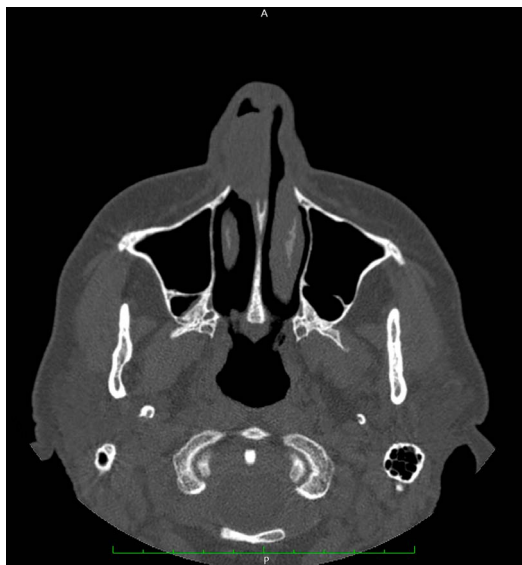
Figure 1: Axial Computed Tomography (CT) Scan without Contrast Showing a Soft Density Polypoid Mass Occupying the Anterior Portion of Right Nasal Fossa, Associated with Cartilaginous Nasal Septum Perforation. The Tissue Arises from the Cartilagineal Portion of Nasal Septum and is in Contact with the Lateral Wall of the Nose. Minimal Signs of Body Erosion are Present. Around Structure and Maxillary Sinus are Not Involved.

Underwent a trans-nasal endoscopic excision of the mass under general anesthesia. Histological examination showed mixed inflammatory cells T-lymphocytes (CD3 + , CD56 + ), histiocytes (CD68R + ) and granulocytes associated to fibrin necrotic material and vascular structures with elastic lamina fragmentation and lumen obliteration. Due to the histological suspicion of a vasculitides, Dosage of c-ANCA e p-ANCA antibodies revealed the presence of GPA (the complete immunological tests are reported in Table 1). The post-operative course was uneventful, and the