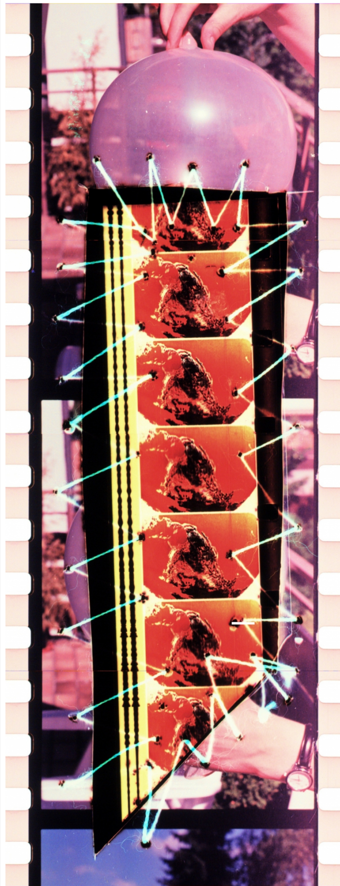
Fig. 1: A composite image of a section of c: won eyed jail (Kelly Egan, 2005), 35mm, colour, sound, 5 min. Courtesy of the artists. All rights reserved.