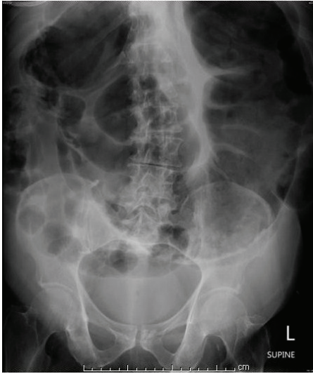
FIGURE 1: A plain abdominal X-ray showing the colonic dilatation with a cutoff at the rectum.