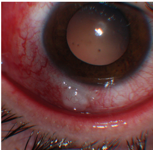
FIGURE 2: An unintentional conjunctival bleb at 7 o'clock.

the location of the IOFB was marked by an intentional corneal abrasion followed by a fluorescein staining. A bilevel wide opening above the marking exposed the foreign body, allowing for its uncomplicated removal. The IOFB was identified by a forensic lab as an iron. Two months following surgery, an unintentional bleb was observed (Figure 2). Anterior segment optical coherence tomography (ASOCT) showed a scleral flap covered by conjunctiva (Figure 3). The patient reported that she was unable to wear her contact lens, likely secondary to this finding. Despite normal intraocular pressure, a surgery for resecting the bleb was scheduled. However, surgery was canceled due to acute conjunctivitis. Six months later, the patient reported improvement, and examination revealed a significant flattening of the bleb, which allows for contact lens use. Of note, the patient's visual acuity was 6/6 OU.