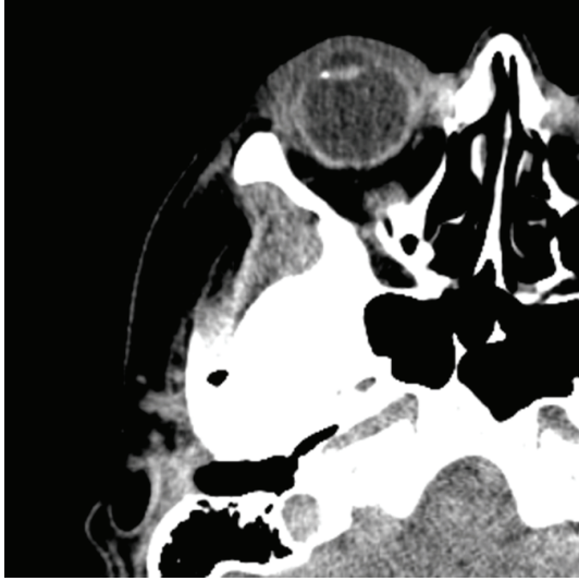
FIGURE 1: A noncontrast CT scan demonstrating foreign body resting on the zonules area.