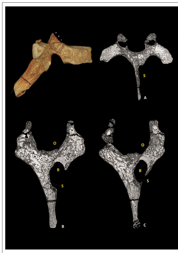
Key: S – quiescent sclerotic zone, O – active osteolytic zone, B – remaining breccia matrix infill.

at the approximate level of the superior articular facet. The internal morphology shows no involvement of the transverse process or pedicle, and the lesion does not penetrate the vertebral canal. No mineralised focal point or nidus was discerned. The edges of the first two-thirds of the lesion (moving dorsal to ventral) display sclerotic characteristics, with circumscribed margins of well-integrated cortical bone, abutted and intersected by trabecular striae (Figure 5 and Supplementary Appendix). This pattern is indicative of a slow-forming bony process, with remodelling and reorganisation of posterior aspects of the lesion. The shape of a lesion is indicative of its growth rate, with lesions that are long and oriented with the long axis of a bone indicating a nonaggressive benign process. The ventral third of the lesion, however, displays a geographic pattern of bone destruction, showing a sharp non-sclerotic margin and evidence of active osteolytic processes, with sharply-defined transection of individual trabeculae, and active osteolytic penetration into the anterior portion of the lamina. A volume-rendered negative surface model of the lesion (Figure 6) demonstrates the clear distinction between the dorsal sclerotic zone and the ventral lytic zone within the body of the active lesion.