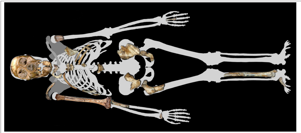
Figure 1: Surviving skeletal elements attributed to Malapa Hominin 1 (at time of writing).