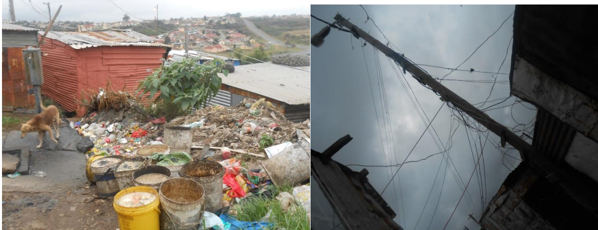
Image 2: C Section community stand-pipe and shacks that are illegally connected to electricity. Photo taken by Patricia Ndlovu -10/08/2014

Image 2 portrays some of the conditions that some residents of Duncan Village live under, and illegal connections to electricity. For some of the residents of Duncan Village, there is no dignity in having their shacks electrified, yet they live under precarious conditions. Residents noted that it is difficult to control people to keep community taps clean. Illegal connections also make them live in fear that they their shacks can burn down at any time. In a focus group discussion one participant noted that: