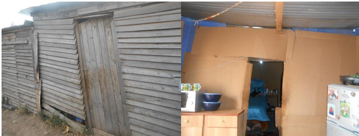
Image 1: The external (made of wood) and internal (lined with cardboard) parts of the shack where I stayed during my research at Ford Street, Duncan Village: Photo by Patricia -1/08/2014.

In the informal parts of Duncan Village residents use communal stand-alone toilets that are provided by the municipality and stand-pipes located mainly at the edge of each informal settlement. These communal toilets are shared at least by a hundred to three-hundred people depending on the size of the settlement. There is a strong reliance on the bucket system for daily activities particularly in the informal parts of Duncan Village. Residents prefer to use the bucket system since in many areas toilets are far from their shacks and they are dangerous to use especially at night.