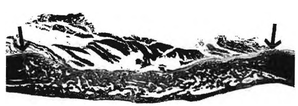
Fig. 1. (left) Cartilage and bone differentiation in the subcutaneous space of a rat 11 days after implantation of osteogenin purified from baboon bone matrix.