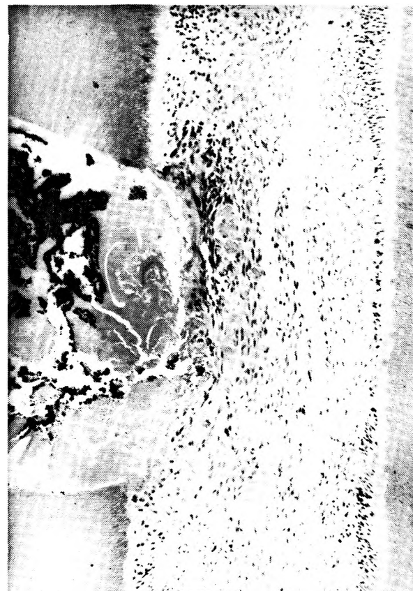
Fig. 2. In this exposed pulp there is no dentine bridge. A mild pulpal inflammatory response is present. Haematoxylin and eosin. X 300.