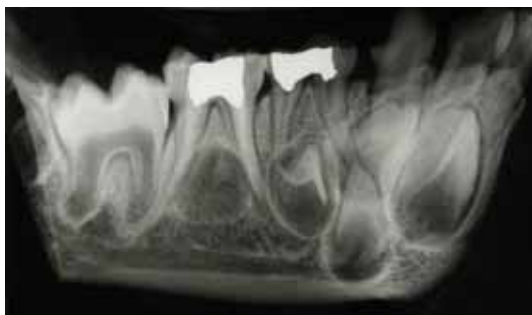
FIG. 3 - Radiograph of excised jaw quadrant showing an apical abscess at the mesial root of the second primary molar partly obscured by overlapping tooth germs. There is also widening of the periodontal ligament at the mesial and distal apices of the first primary molar.

and 82% of the CH teeth. When tissue was seen, this was almost always at the tooth apex indicating successfully extirpated pulps (Fig. 1). External root resorption, other than that normally part of exfoliation, was uncommon but the rate in CH teeth was twice that in ZOE teeth. Bacteria were seen more frequently in CH teeth than ZOE teeth. Periapical abscesses (Fig. 2) were present in over half of the CH teeth and a quarter of the ZOE teeth; in both groups bacteria were not commonly seen in the abscess. It was not possible to see all the histological abscesses on the radiographs, in spite of the clarity of the radiographs without soft tissue, because of the size of the abscess and overlapping of developing teeth. An example of an abscess that was seen on a radiograph is shown in Figure 3.