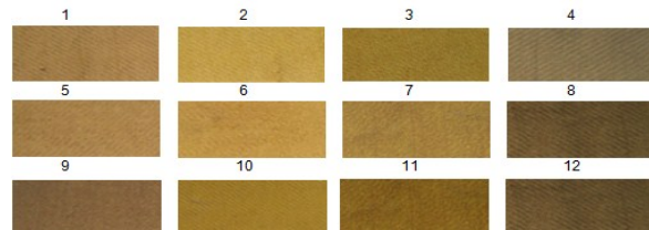
Fig 2. Actual image of the dyed samples (the sample number indicates the conditions given in Table 1).