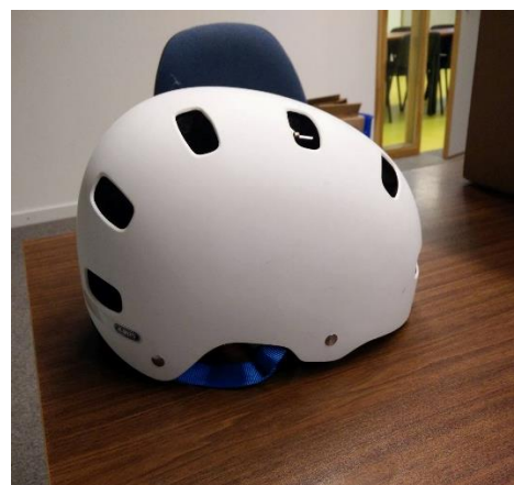
Figure 1. The PDE-Helmet. The locations of the antennas inside the helmet are shown on top. The interior of the helmet showing the padding in black, the folded stub antennas with receiver nodes in green-black-gold, and the battery in white, are shown on the bottom left. The device in its final form-factor is shown on the bottom right.