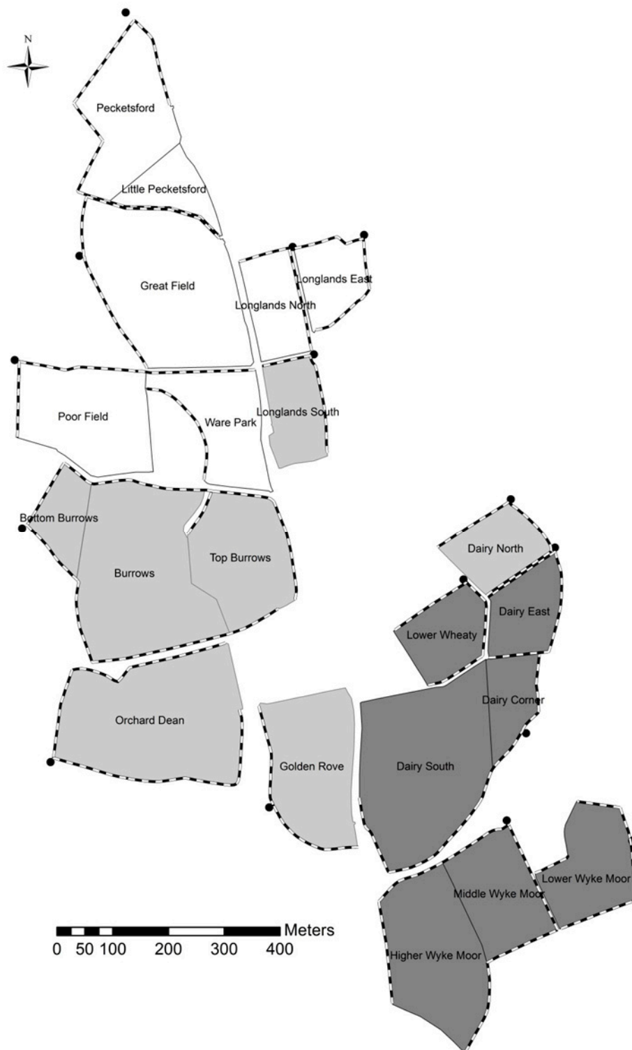
Figure 1. The NWFP farmlets: A (□), B (▒) and C (■); French drains (---) and water monitoring sites (●).

Weather data were recorded every 15 min with an automatic met station installed on-site. Total annual rainfall for 2011 was 835 mm and for 2012 was 1046 mm. Solar radiation for 2011 and 2012 is shown in Figure 2.