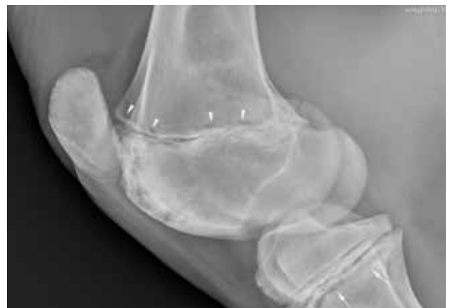
Figure 2. Lateromedial radiograph of the right stifle joint. Patchy radiolucent areas are detected within the lateral and medial trochlear ridges, and within the distal physis of the femur (arrowheads). An irregularly outlined, linear radiolucent area is also detected adjacent to the proximal physis of the tibia (arrows).

A CT examination was performed post mortem for educational purposes. A large, ill-defined structure was detected within the left caudal abdomen, causing a mass effect on the surrounding structures (Figure 4A). The content was heterogeneous and hypoattenuating with a tissue density of approximately twenty