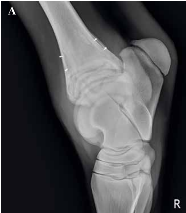
Figure 1A. Initial lateromedial radiographic examination of the right tarsus. Soft tissue swelling is present at the cranial aspect of the distal tibia. Ill-defined subcortical radiolucent zones are seen within the distal metaphysis of the tibia (arrowheads), as well as ill-defined, radiolucent areas within the distal physis.