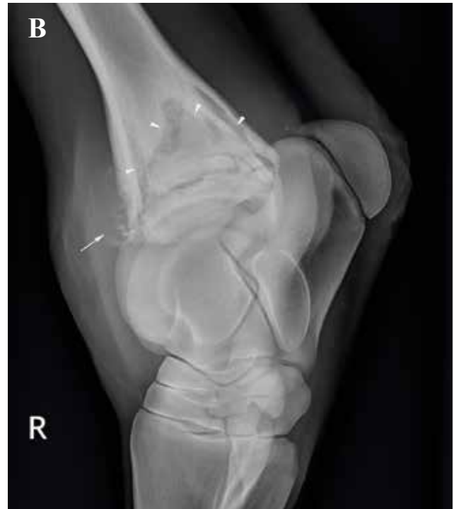
Figure 1B. Radiographic examination on day 36. There is an increased soft tissue swelling at the cranial aspect of the distal tibia. The radiolucent zones within the distal metaphysis are markedly more conspicuous and well-defined, creating a triangular shape (arrowheads). Irregular new bone formation is present at the craniodistal aspect of the tibia, extending into the adjacent soft tissues (arrow).

lameness short term. Three follow-up centeses were performed with progressive improvement of the values. However, after one month, the foal would no longer stand or get up unassisted.