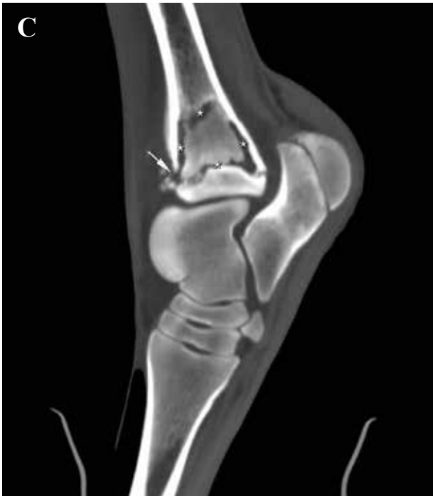
Figure 1C. Post-mortem computed tomographic image of the same limb. Well-defined, linear hypoattenuating zones are seen adjacent to the cortex of the distal metaphysis and within the distal physis of the tibia (asterisk symbols). The craniodistal tibial cortex is disrupted (arrow). The triangular, hypoattenuating zone within the distal metaphysis was consistent with pus accumulation found on gross pathology.

detected. Severe, ill-defined, radiolucent areas surrounded by sclerosis were present within the femoral trochlear ridges of the right hind. Radiolucent areas were also detected within the metaphysis and physis of the distal femur. A similar linear, radiolucent area adjacent to the proximal physis of the tibia was also seen in the right hind (Figure 2). A diagnosis of arthritis of the femoropatellar joint and osteomyelitis type E and P involving the distal femur and proximal tibia was made.