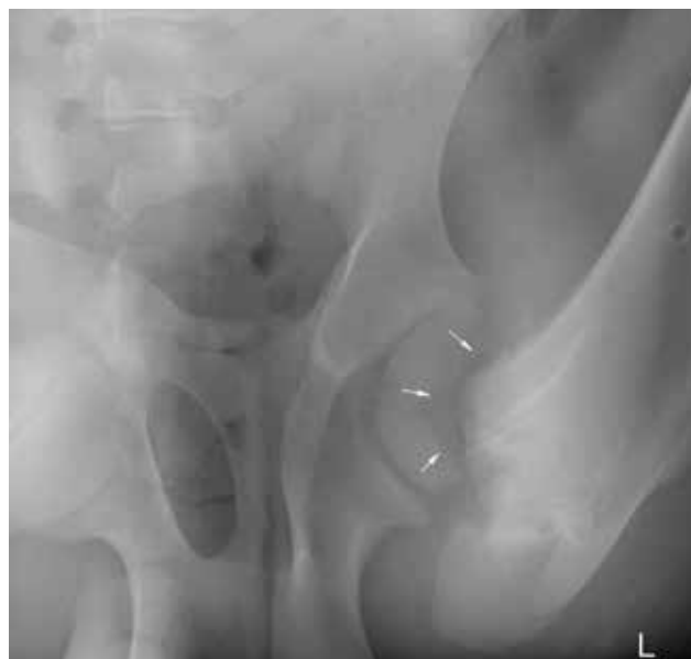
Figure 3. Ventrodorsal radiograph of the coxofemoral joints. There is a complete disruption of the proximal physis of the left femur consistent with a Salter-Harris type I fracture (arrows). The femoral head is still located within the acetabulum, however there is a caudal displacement of the distal femur in relation to the femoral head.

A large encapsulated abscess of 25x21x35 was found at the level of the left kidney; however, no involvement of the kidney was seen. Several fistula tracts extended from the abscess. One fistula (1cm diameter) extended to the cranial aspect of the ileum wing, at the level of the tuber coxae, and ended in a round/oval shaped abscess of 12x5cm. An additional fistula tract extended distally between the quadriceps femoris muscle, and ended deeply within these muscles without a clear demarcation. Several abscess formations were seen including one abscess within the popliteal region, caudal to the left stifle joint, with a connection to the caudal aspect of the tibia, one abscess of 13x16 cm located at the medial aspect of the left stifle joint, with fistula tracts extending to the ventral aspect of the pelvis as well as the skin surface, and one abscess of 26x2-3 cm located dorsally to the