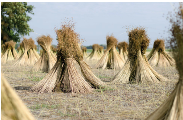
Figure 2. Flax plant.

(Cohen et al., 1999; Gonçalves et al., 2002; Hillyer et al., 2002).