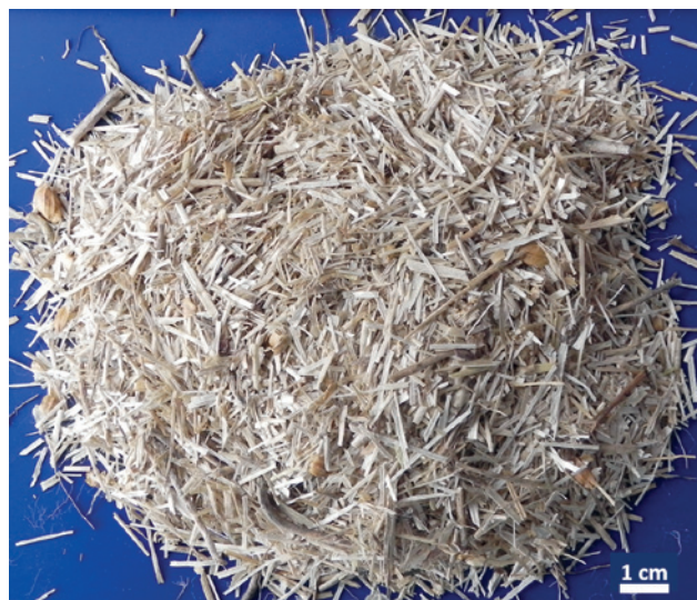
Figure 3. Flax shives.

The limitations of this study include the retrospective character of this study and the fact that not all data were available. Model fit during the multivariable logistic regression was assessed using -2 Log likelihood and the Hosmer and Lemeshow test, which indicated that the model estimates fit the data at an acceptable level. However, Cox & Snell R Square and Nagelkerke R Square indicated that only a minor percentage of the variation was explained by the logistic model (1-4%), which might be explained by the low number of ileal impactions in the population as well as the presence of other influencing factors such as feed or parasite infestation, which were not included in the analysis. Confounding factors, such as type, amount and quality of forage, access to pasture, amount and nutritional composition of concentrates or other nutritional supplements, access to sand, dental disorders,