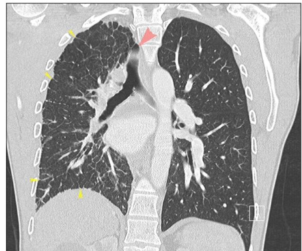
Figure 1: CECT of the thorax, lung window, coronal reformatted image. Hyperinflation of the left lung, smaller volume of the right lung. Mediastinal shift to the right side (red arrow pointing to displaced trachea). Thickened intralobular and interlobular septa (yellow arrows).

Unilateral absence of the pulmonary artery (UAPA) that normally arises from the sixth aortic arch is a very rare congenital malformation with a prevalence of 0.0005%. It may be isolated, but it is more often associated with other congenital cardiac defects such as aortic coarctation, tetralogy of Fallot, atrial septal defect, patent ductus arteriosus, truncus arteriosus, right aortic arch and pulmonary atresia [1]. UAPA is more common on the right side [1]. UAPA may present in infancy with respiratory distress, pulmonary hypertension and congestive heart failure [1]. When severe pulmonary hypertension does not develop in infancy, the condition may remain asymptomatic until adulthood. Adults with isolated UAPA can present with recurrent respiratory infections, exercise intolerance and haemoptysis [1]. Haemoptysis is caused by excessive collateral circula-