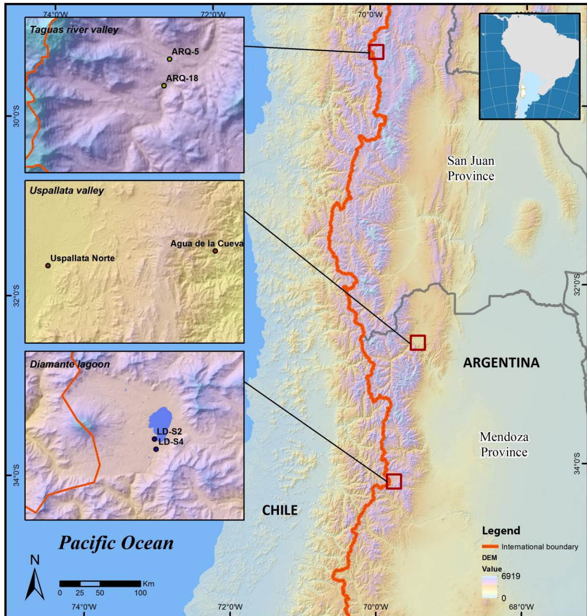
Figure 1. Study area and archaeological sites.

(Cabrera 1971). Mountain wetlands or vegas are very important because they have offer rich summer pastures, especially for guanacos ( Lama guanicoe ), which are the largest mammals and most important prey in the Andes. In the northern and central part of the study area, lithic raw materials are principally chert and rhyolite; in the southern area, there is good availability of obsidian (Castro et al. 2014; Durán et al. 2012; Cortegoso et al. 2017; Cortegoso 2008; Lucero et al. 2006).