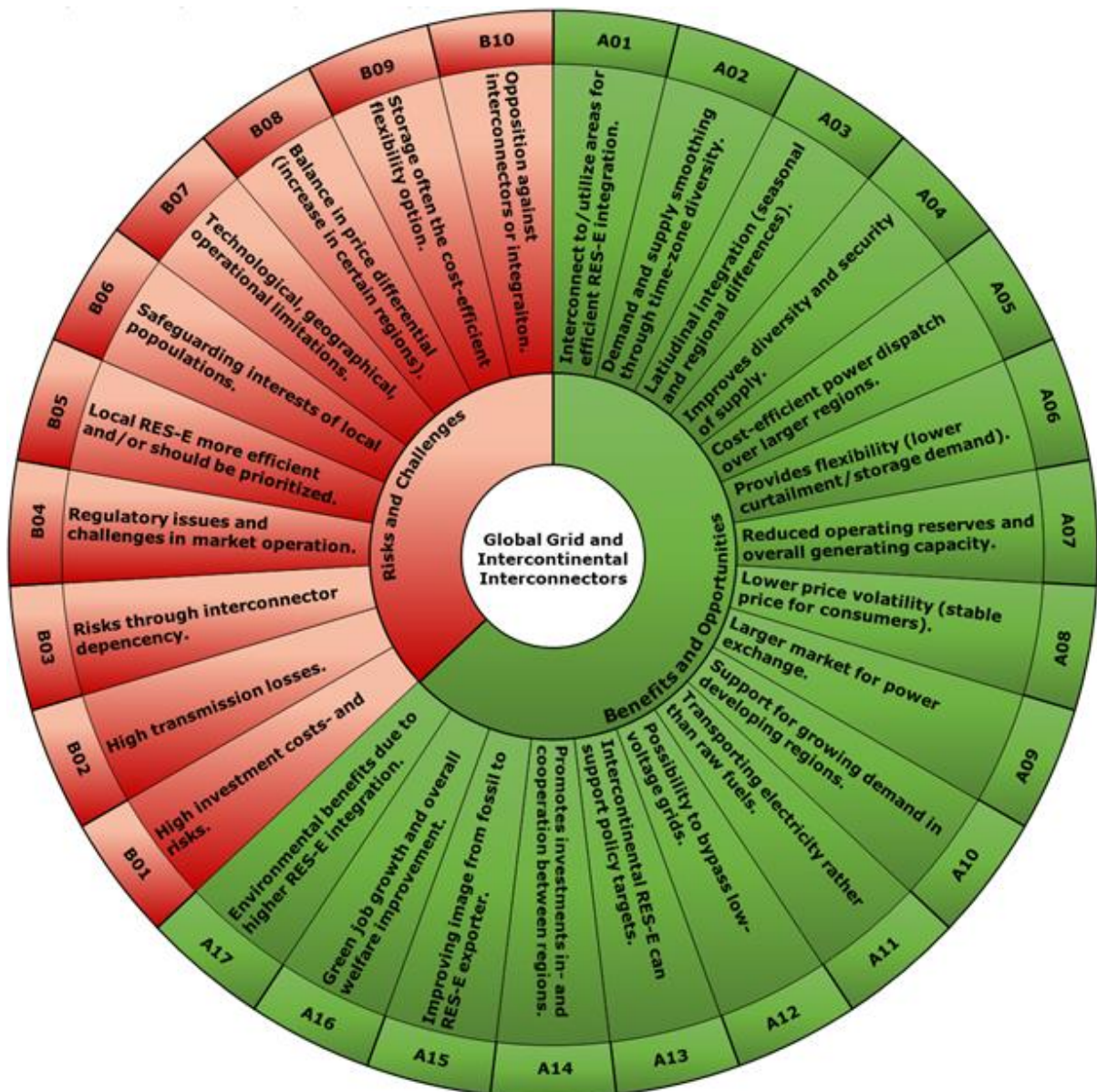
Figure 2 Overview of mentioned benefits, opportunities, risks and challenges for a global grid and/or intercontinental interconnectors within the literature. The outer ring corresponds to further description of the benefits and opportunities (A) and risks and challenges (B) within this section.