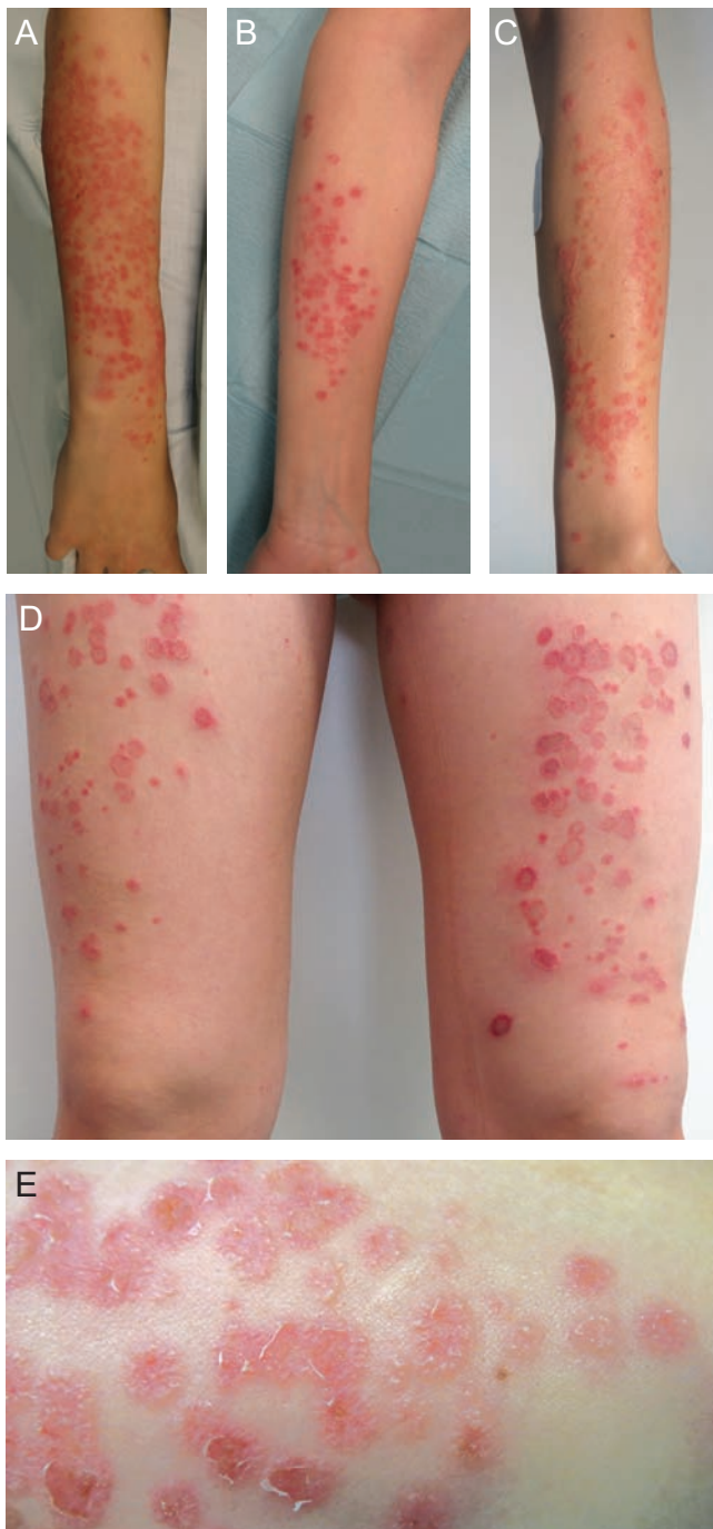
Figure 1. This 26-year-old woman presented to us with multiple annular erythematous plaques of 0.5 to 2 cm in diameter and elevated borders on both forearms, both thighs, and abdomen. The pictures, taken on the occasion she presented, show the posterior aspect of the right forearm (A), the anterior (B) and posterior (C) aspects of the left forearm, and the anterior aspect of both thighs (D). A close up of the lesions can be observed (E).

Considering the patient's anamnesis and this unusual pattern of tinea corporis , with simultaneously arising lesions in the sites where the microneedling device was applied, we can consider that the disruption of the epidermis by the microneedles facilitated the infection of multiple sites when in contact with the infected cat and/or bed linen. Microneedling dramatically increases the skin's permeability to therapeutic and cosmeceutical substances by creating reversible microchannels in the skin. 6,7 This enhanced permeability was shown to be optimal at 5 minutes after microneedling with 1 mm long needles, and drastically reduced after 30 minutes. 6 Similarly, while open, these microchannels may facilitate the access of microorganisms or deleterious substances. 6 The exact depth of needle penetration and the effects on skin permeability with the device used by the patient may differ from those results due to a higher density of shorter needles and variations in the pressure used. Nevertheless, in superficial mycoses, fungi invade keratinized tissues, so even if the depth of the microchannels is eventually smaller, the disruption of the stratum corneum is sufficient to facilitate a fungal infection. As the procedure was performed by the patient, a less rigorous pre- and postprocedural care with the device cannot be excluded, and might be an important additional factor.