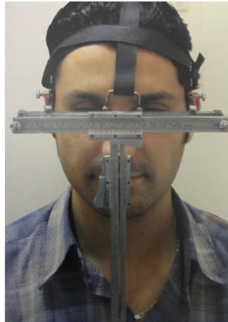
Fig. 1: The Kattan facio-meter, frontal view.

resting on the superior attachment of the ear. They could be adjusted to fit the lateral dimensions of different faces. It also consists of a graduated, sliding vertical ruler perpendicular to the horizontal bar (y-plane) attached to it a sliding ruler in the z-plane. The appliance was secured in place by bands above and around the back of the head (Figs. 1,2).