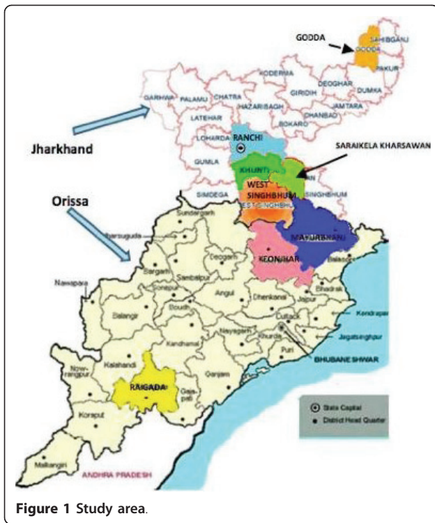
Figure 1 Study area.