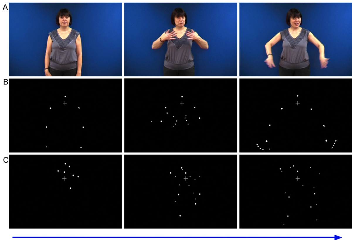
Fig. 1. Still images taken from video showing: (A) natural SL – one of the target signers producing the BSL sign DRESS (shown for illustration purposes; not presented in the experiment), (B) the same signer producing DRESS in point-light form and (C) an example of the motion baseline.

increased to 128 \times 128 , resulting in an in-plane voxel size of 1.875 mm. Other scan parameters ( TR = 3 s, TE = 40 ms, flip angle = 90^\circ ) were, where possible, matched to those of the main EPI run, resulting in similar image contrast.